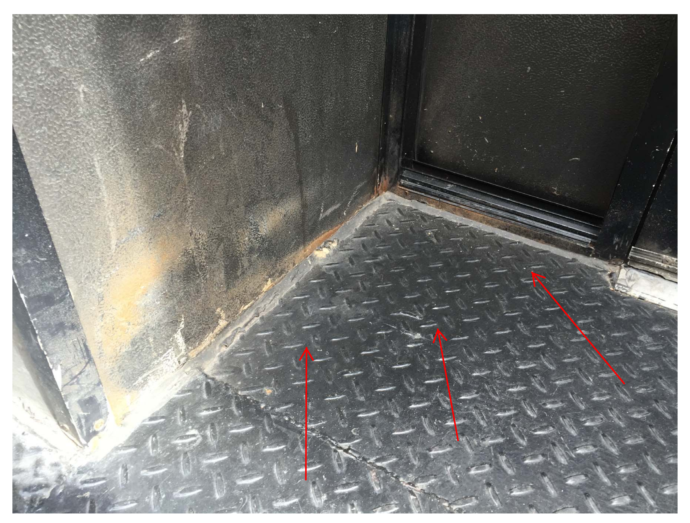
BACK PITCHED PLATING CAUSING WAER INFILTRATION INTO BUILDING ENTRANCE