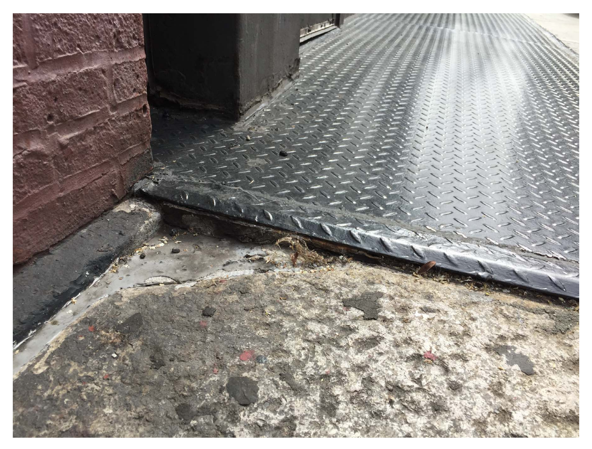
STEEL PLATE CONDITIONS AT THE PERIMETER TRIMMING