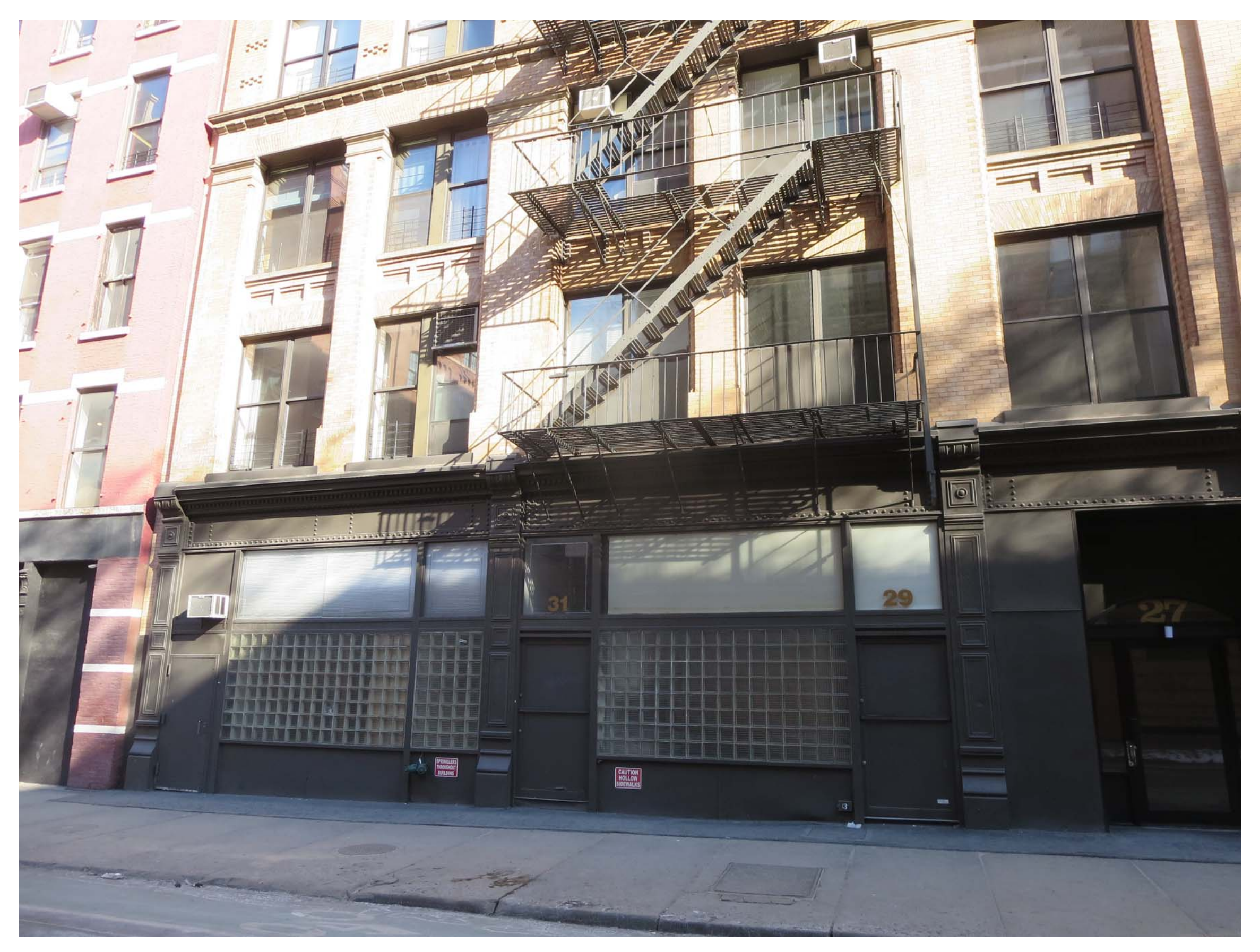
EXISTING CONDITIONS PRIOR TO INVESTIGATION