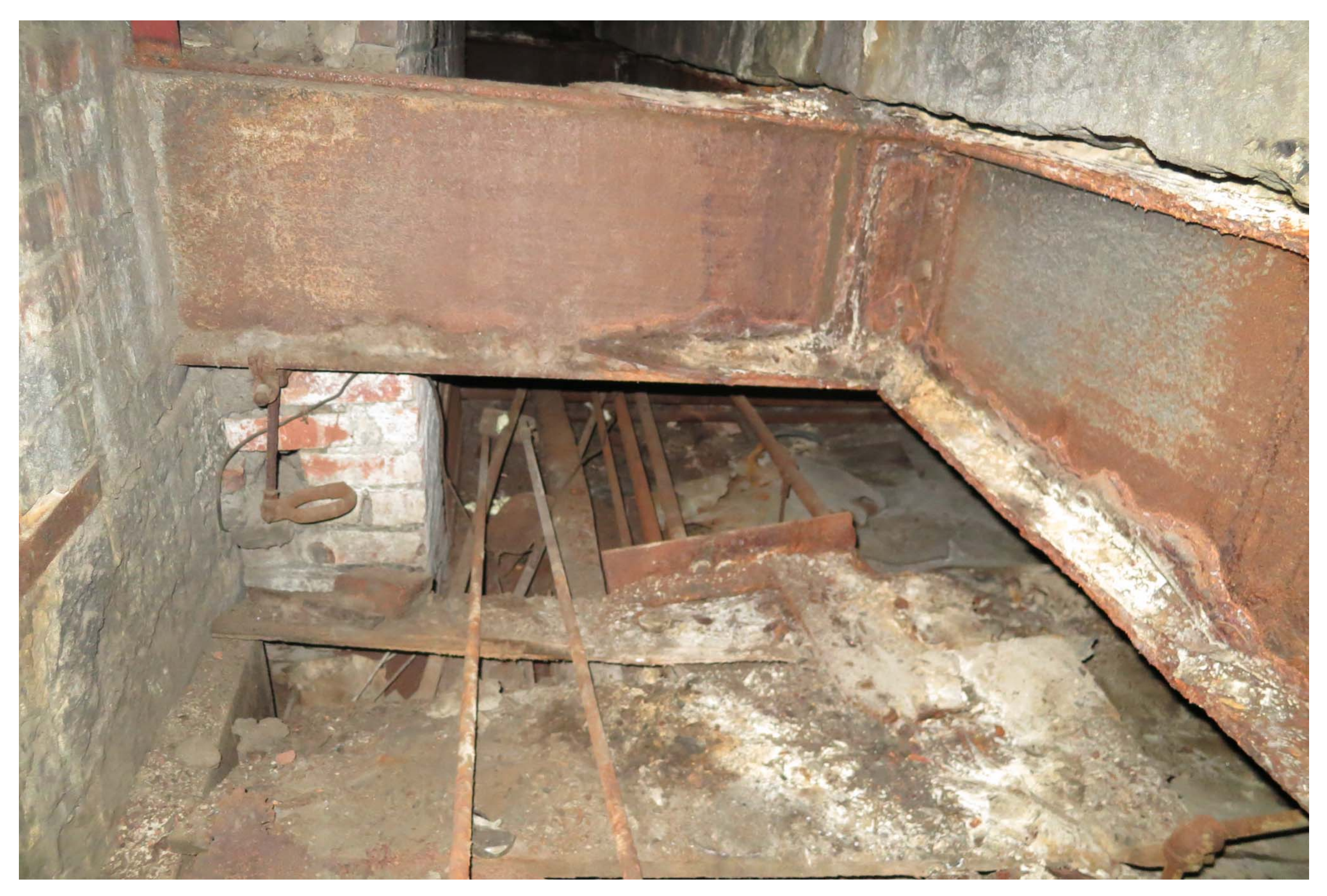
DEFECTIVE PLATING CAUSING FURTHER STRUCTURAL DAMAGE