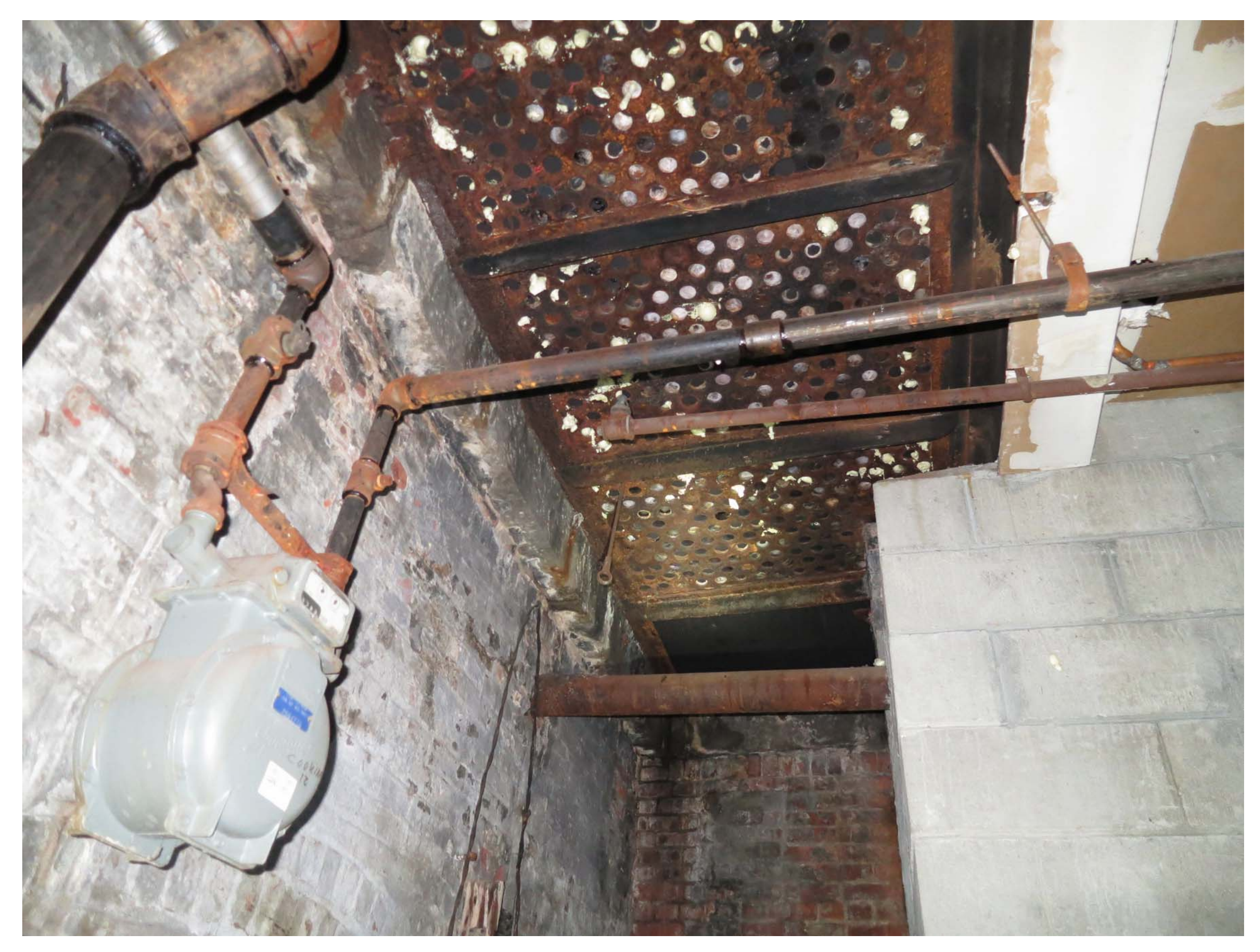
HEAVY CORROSION AFFECTING STRUCTURAL INTEGRITY