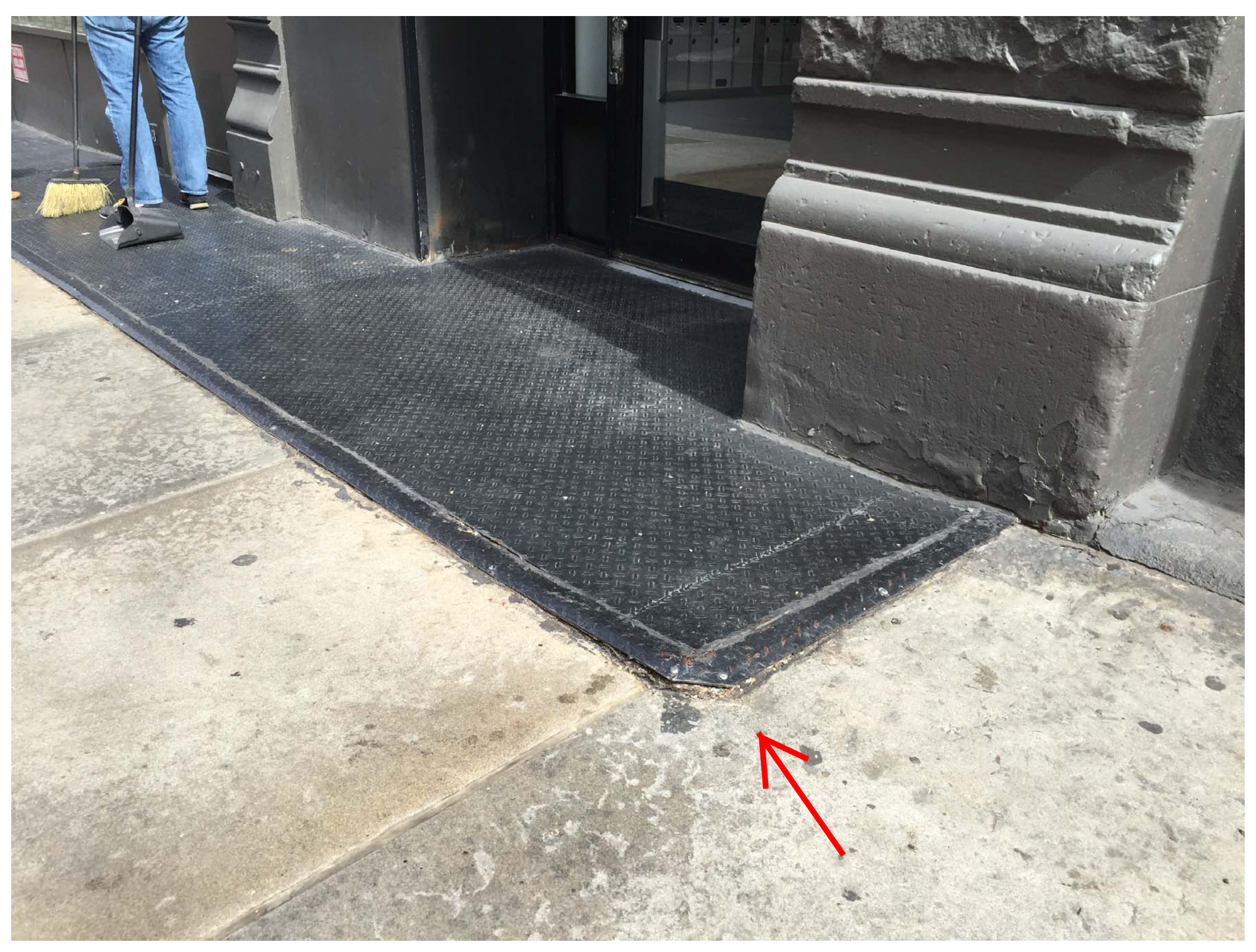
DEFECTIVE STEEL PLATES LIFTED AT THE TRIM