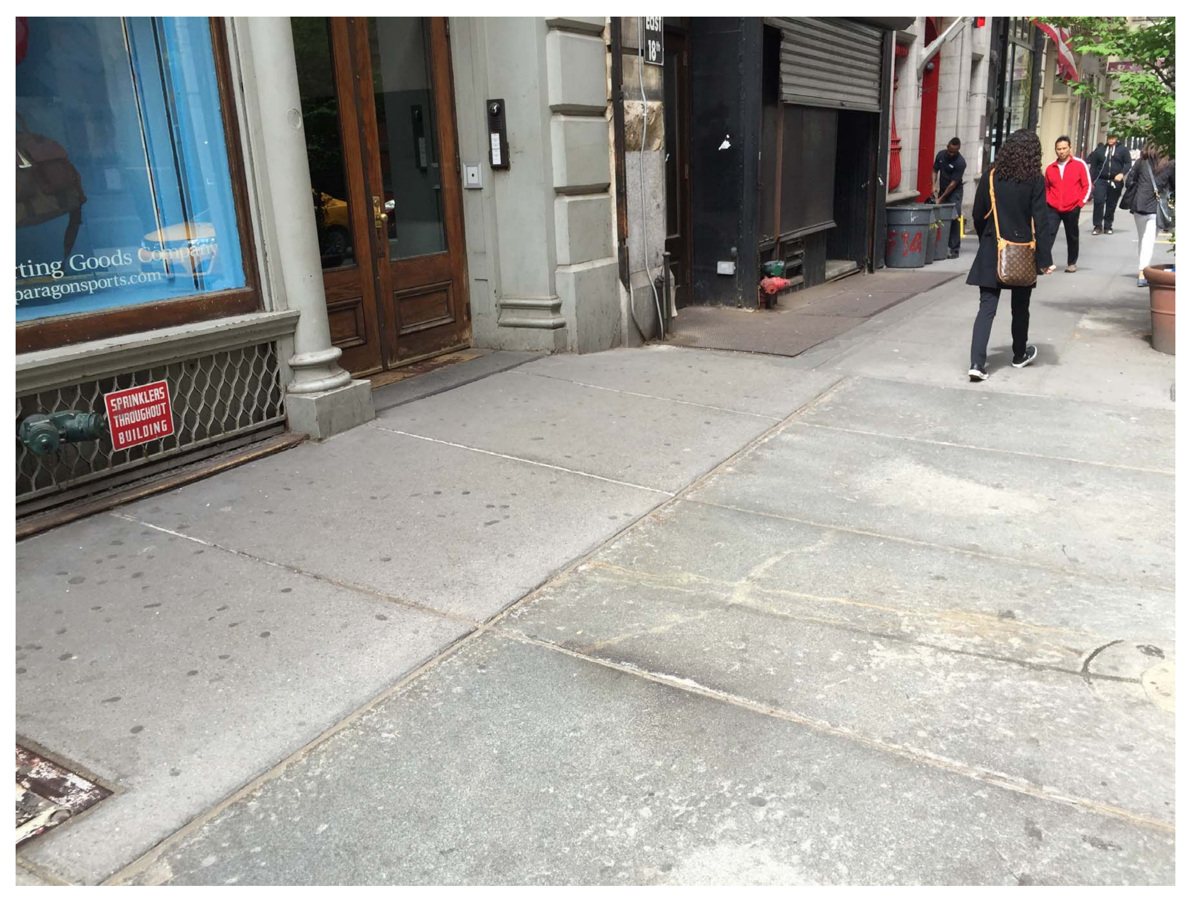
EXAMPLES OF PROPOSED CONCRETE SLAB PLACEMENT AS A CONTINUATION OF STONE SIDEWALK SLAB