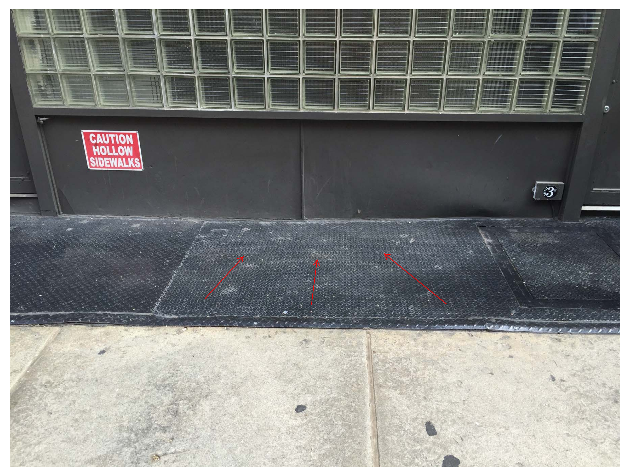
BOWED STEEL PLATING ALLOWING WATER TO POOL AND INFILTRATE