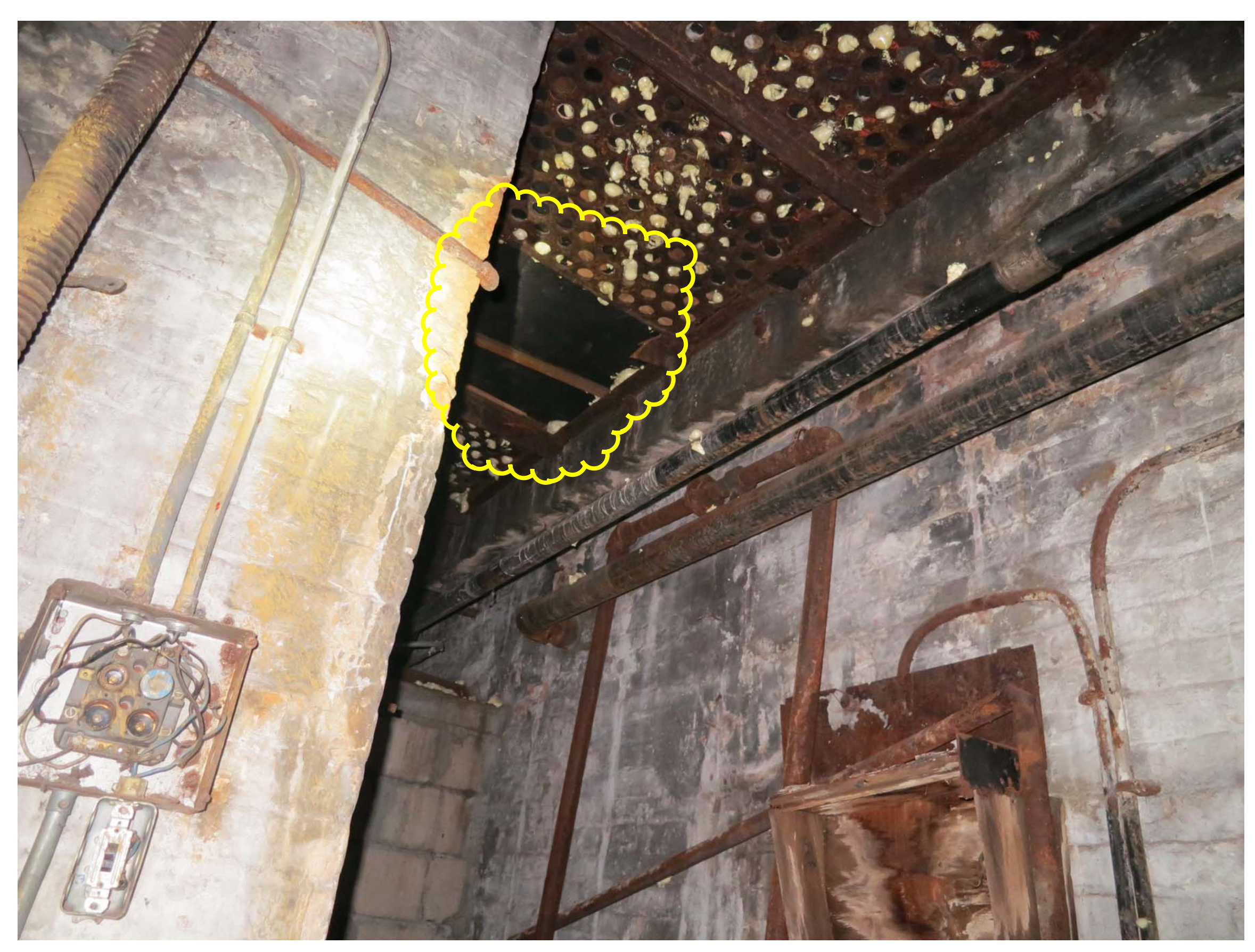
MISSING VAULT SYLIGHTS