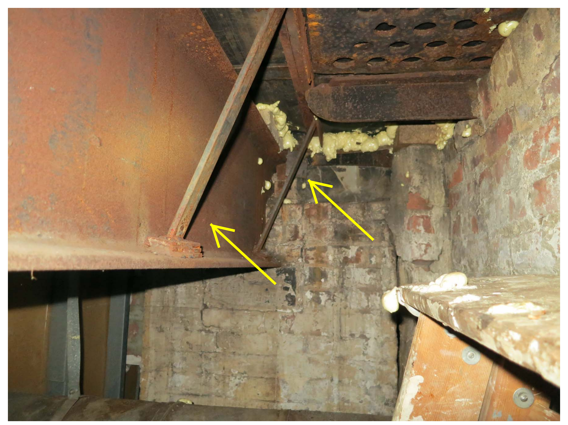
ORIGINAL STRUCTURAL FRAMING IS INADEQUATE FOR SUPPORTING THE DESIGN LOADING OVER THE STEEL PLATE