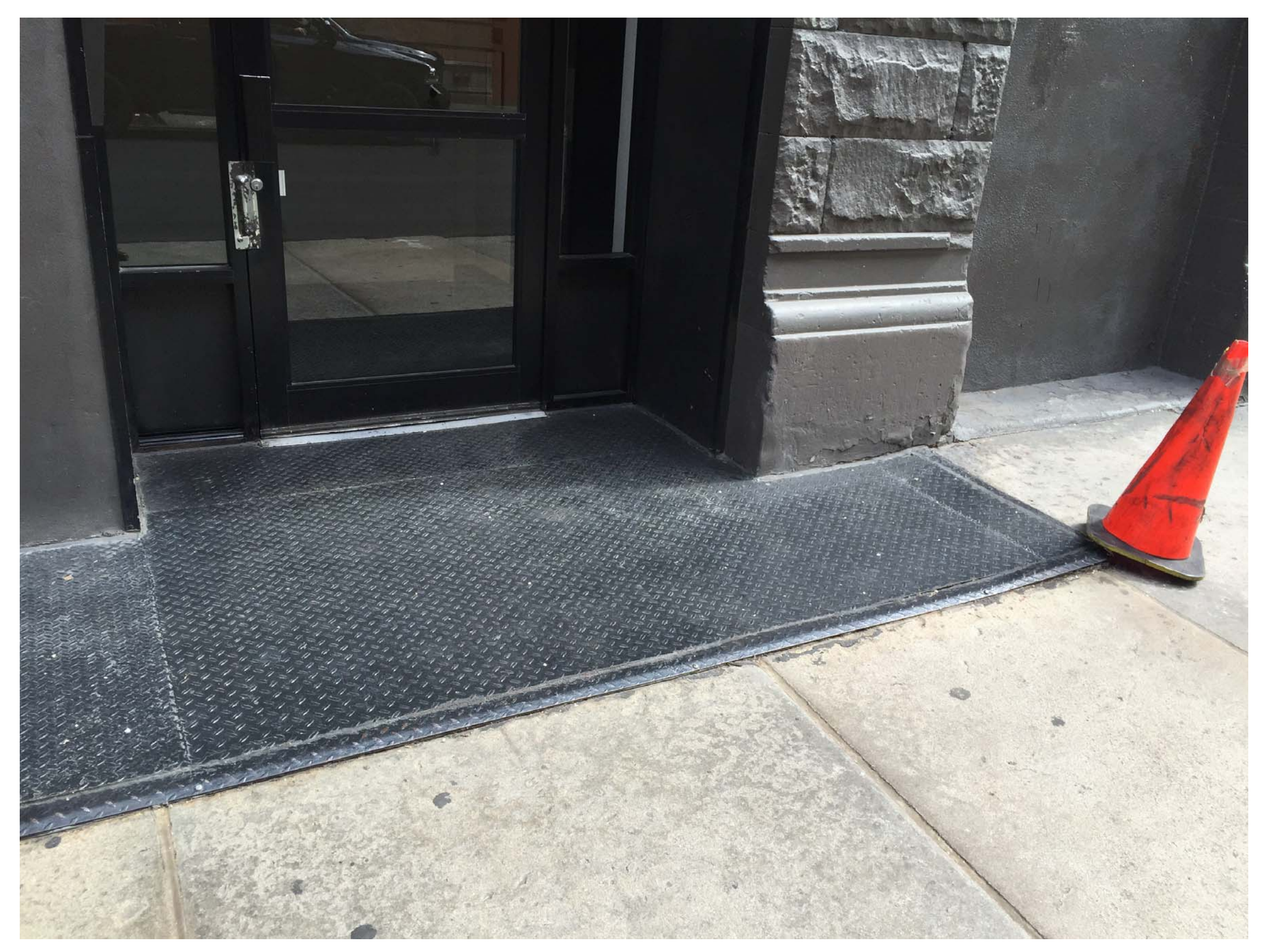
PRECAUTIONARY MEASURES FOR TRIP HAZARD CAUSED BY THE DAMAGE