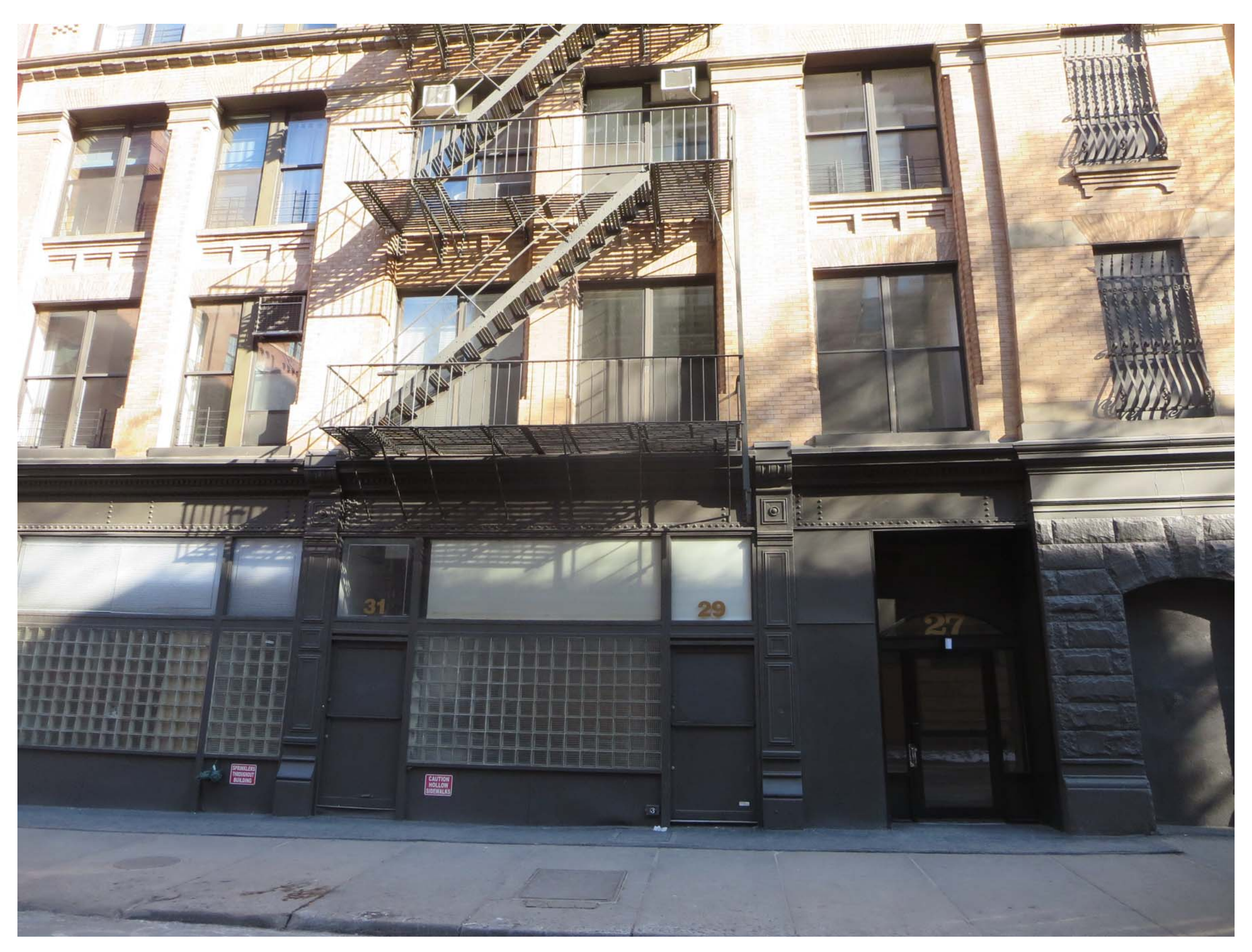
EXISTING CONDITIONS PRIOR TO INVESTIGATION