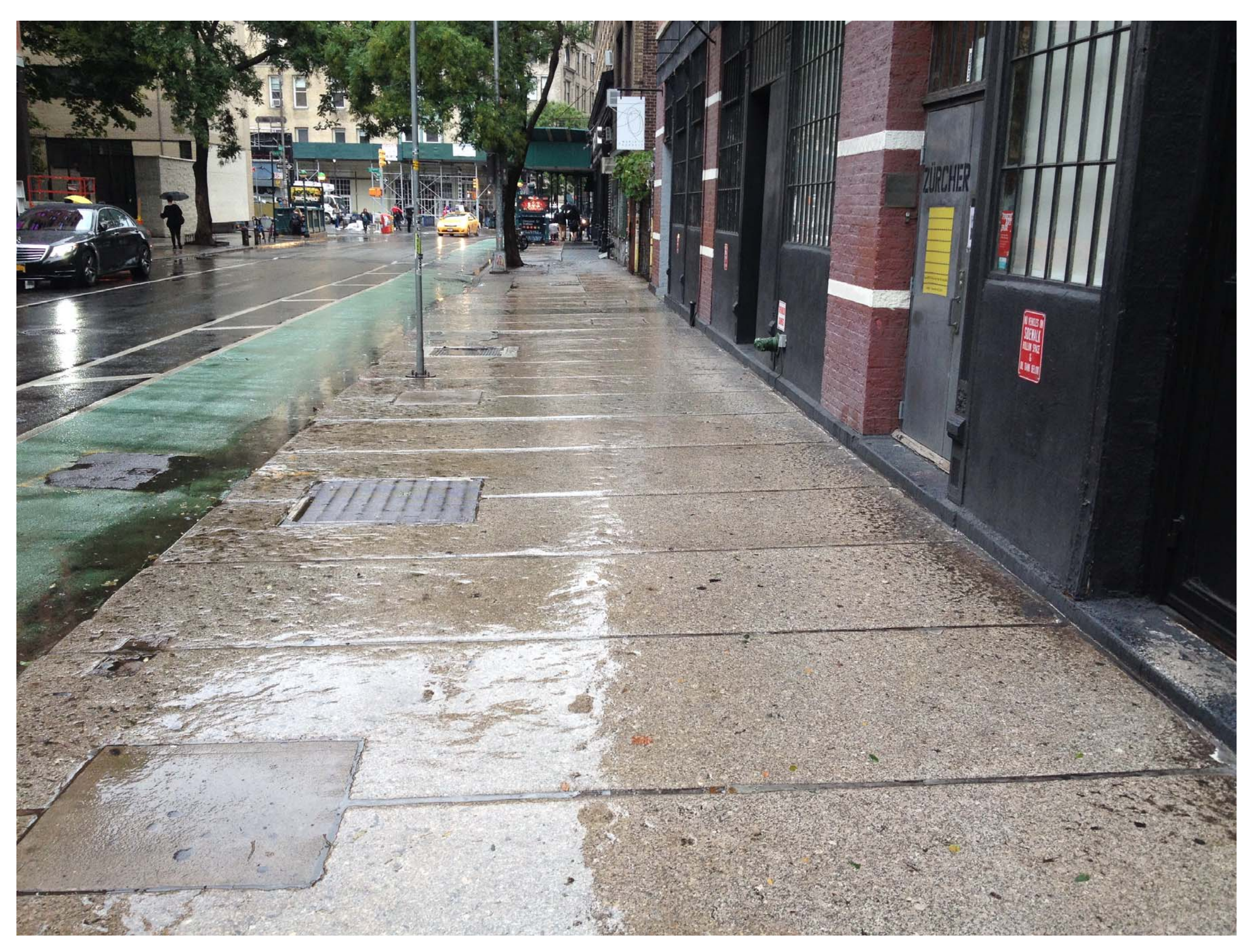
SIDEWALK OF THE NEIGHBORING PROPERTY