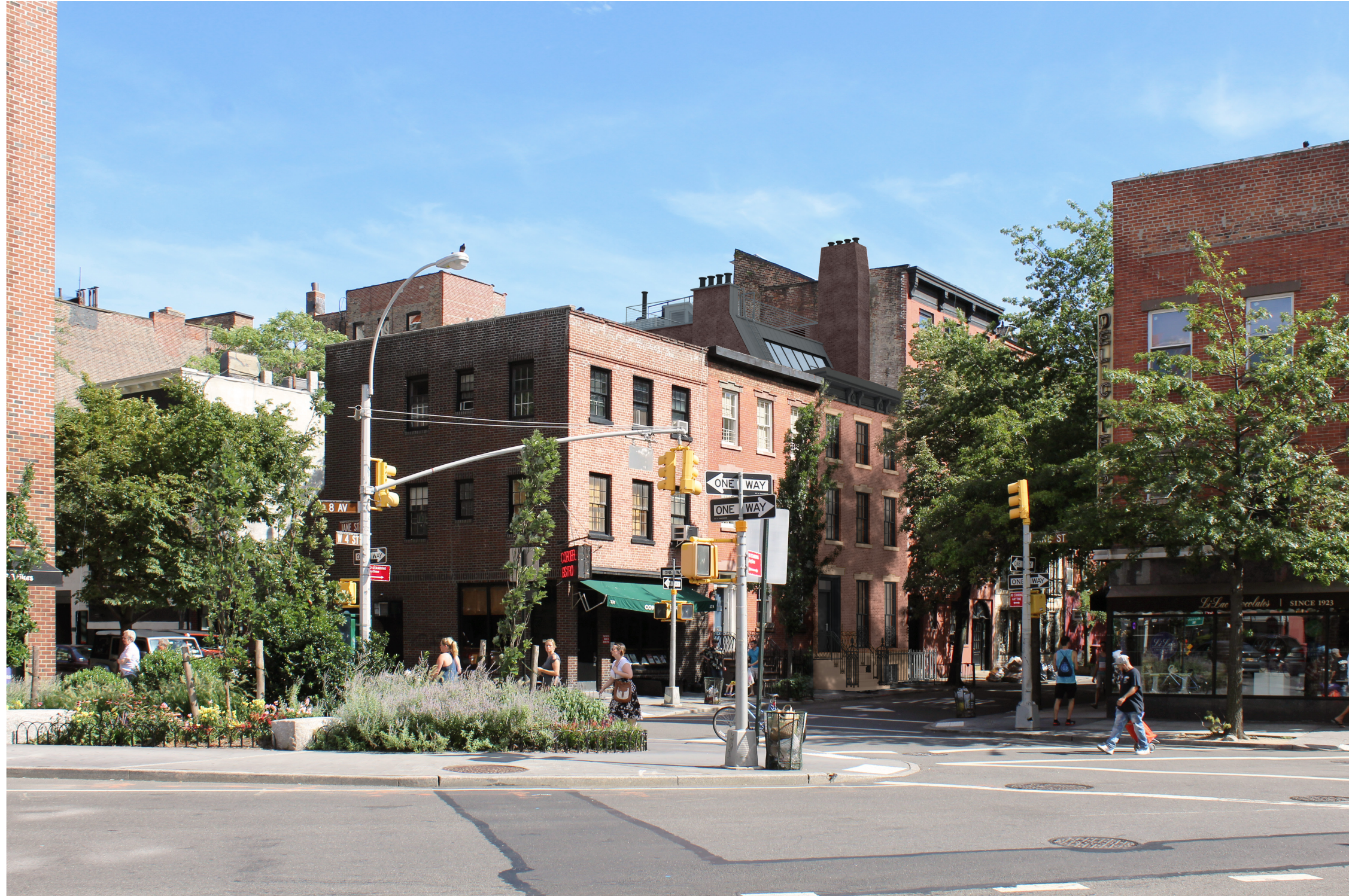
LPC Approved Design: Seen from Eighth Ave. & Jane Street

327 WEST 4TH ST 327 WEST 4TH STREET NEW YORK, NY 10014