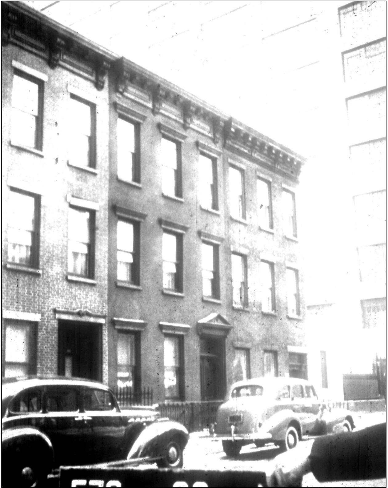
36 Dominick Street House NYC Dept. of Taxes (c. 1939), Municipal Archives