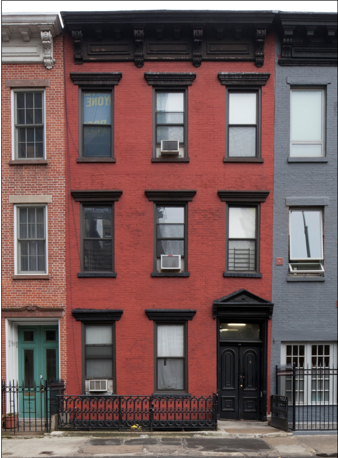
36 Dominick Street House 36 Dominick Street, Manhattan Block: 578, Lot: 62