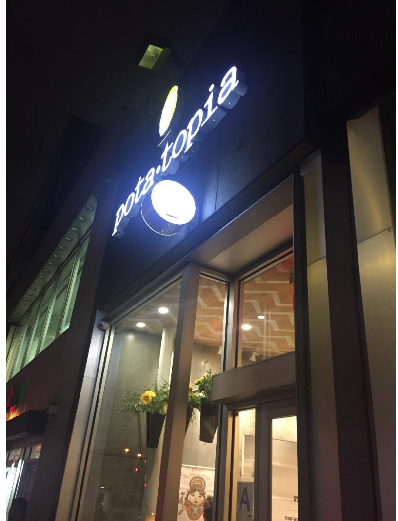
378 Sixth Avenue, Manhattan. Present Day. Day and Night Views.