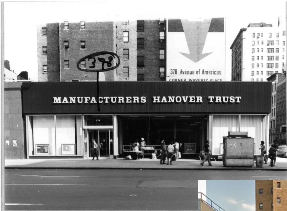
378 Sixth Avenue, Manhattan. Designation Photo.