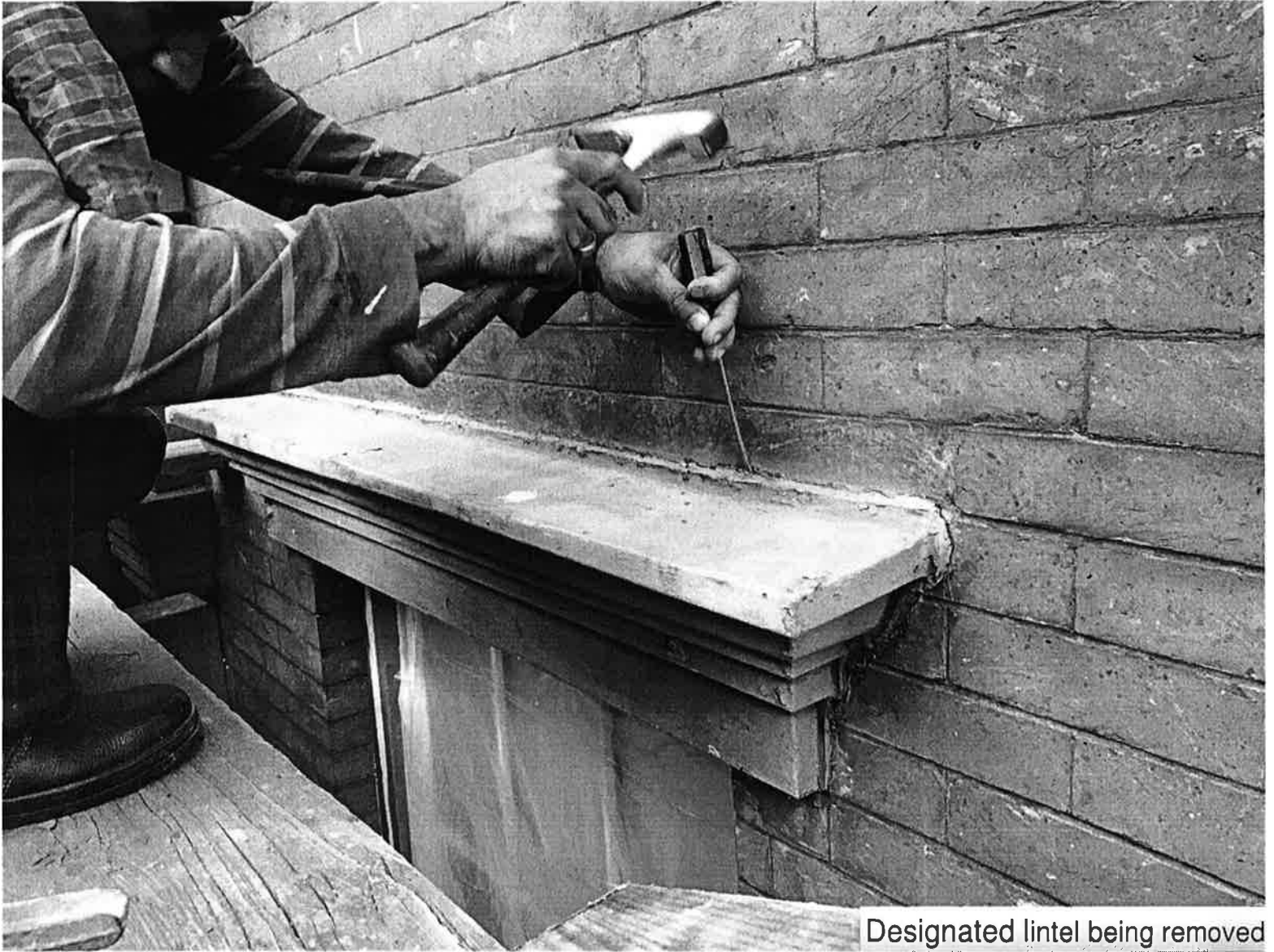
Designated lintel being removed