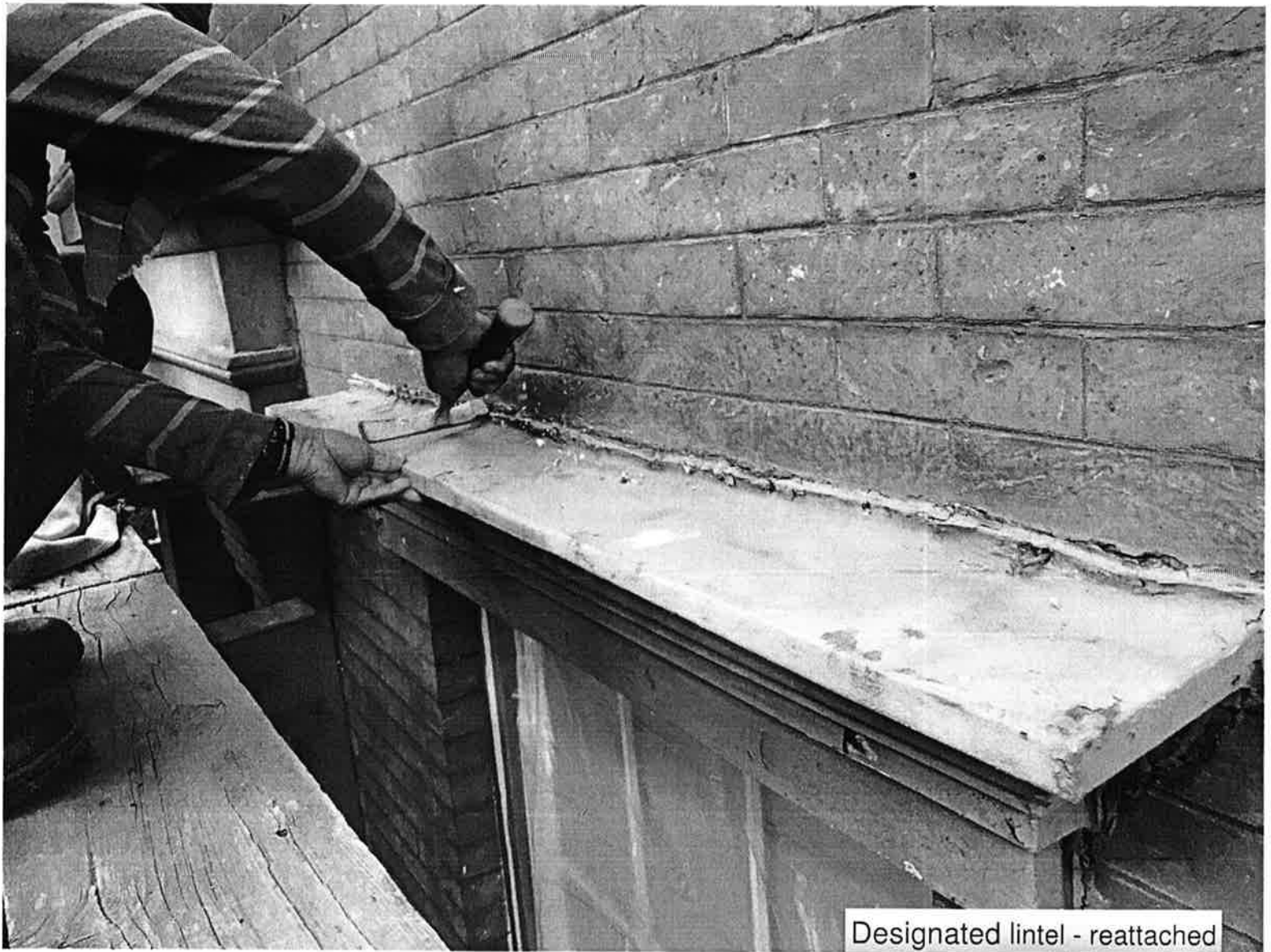
Designated lintel - reattached