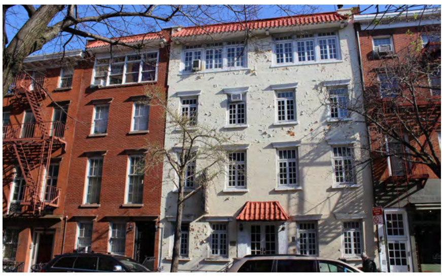
285-289 West 12th Street