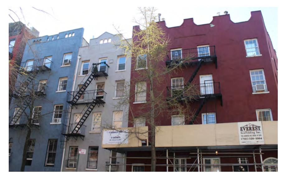
116-120 Perry Street

- Text Excerpts from the Greenwich Village Historic District Extension II Designation Report, June 22, 2010