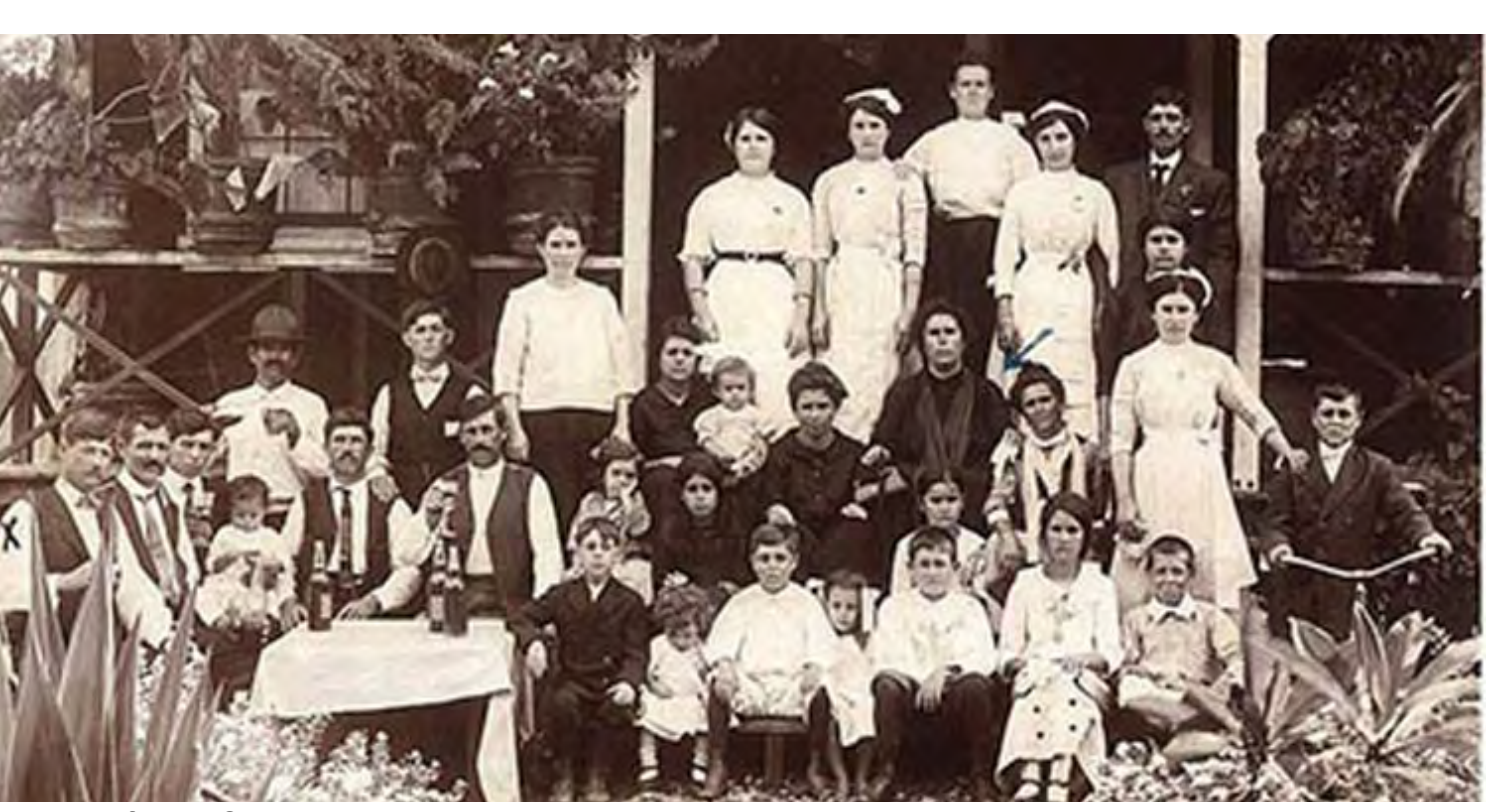
People of Little Spain