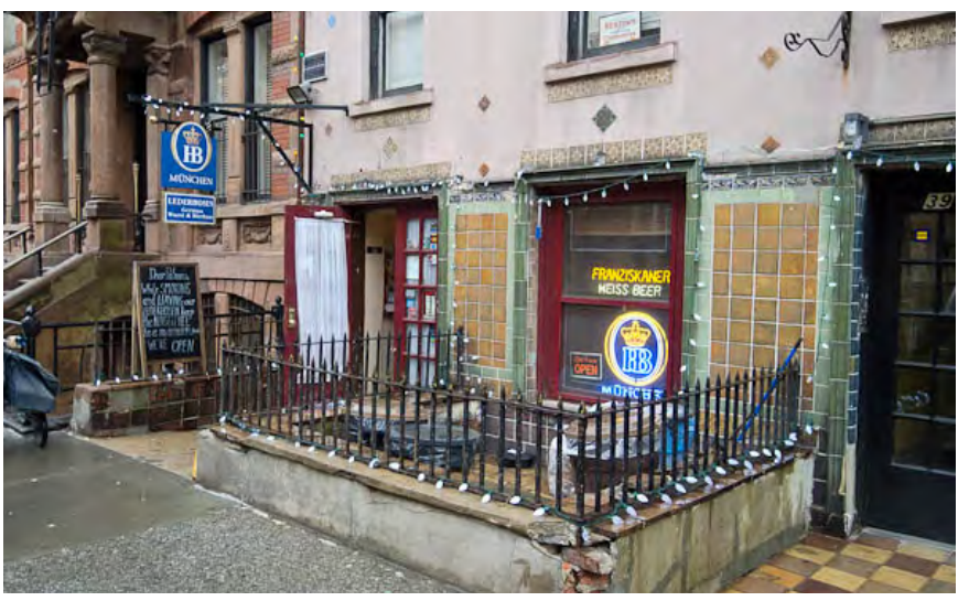
39 Grove Street