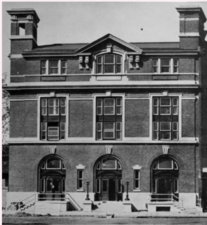
We've made hundreds of new historic images available on our website.

Additionally, we added two hundred new images from our 'Carole Teller's Changing New York' collection, taken by a local artist from the early 1960s to the early 1990s. View all these images at archive.gvshp.org .