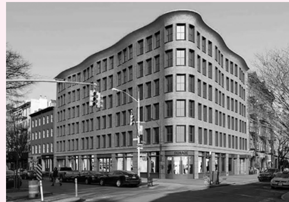
Some of the many controversial approvals by the LPC under the recent chair: (top to bottom) 11 Jane Street, 145 Perry Street, and 540 Hudson Street