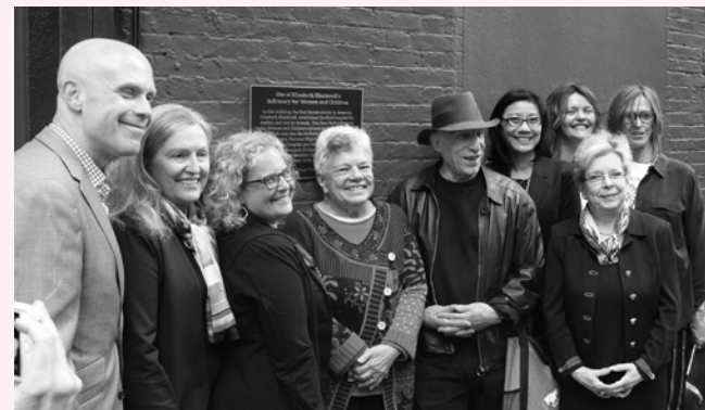
Unveiling the Elizabeth Blackwell plaque.

Historic Plaque In May GVSHP was proud to place a plaque on 58 Bleeker Street in NoHo, the former site of Elizabeth Blackwell's NY Infirmary for Women and Children, the very first hospital run by, staffed by, and serving women. Blackwell was the first woman doctor in America, and a remarkable figure who transformed not only women's role in society but the way healthcare was delivered in this country. We were joined by her grand niece and many luminaries in the fields of women's health care for the unveiling and celebration. Learn more at gvshp.org/plaque .