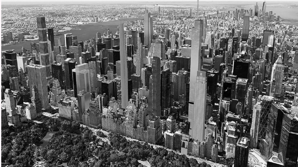
In spite of a record number of supertall buildings rising, the Mayor and real estate industry want the few state restrictions on residential building sizes in NYC lifted.

Following this defeat, GVSHP published an op-ed warning that while the battle was won, the war was not over. The Mayor and his allies in real estate would likely try again to sneak this measure through as part of what's called