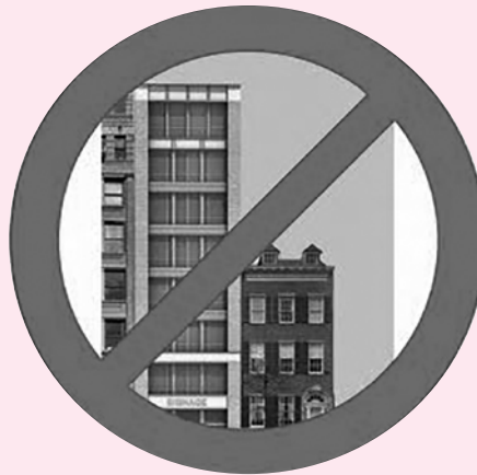
The proposed hotel (I.) next to the Merchant's House.

Unfortunately, the Landmarks Preservation Commission approved the proposed hotel several years ago. But the development also needs several zoning changes, and GVSHP and the museum are fighting those. Community Board #2 turned them down; the application must be approved by the City Planning Commission and the City Council, which will vote later this year. GVSHP will continue to work with the Museum to ensure its safety and preservation.