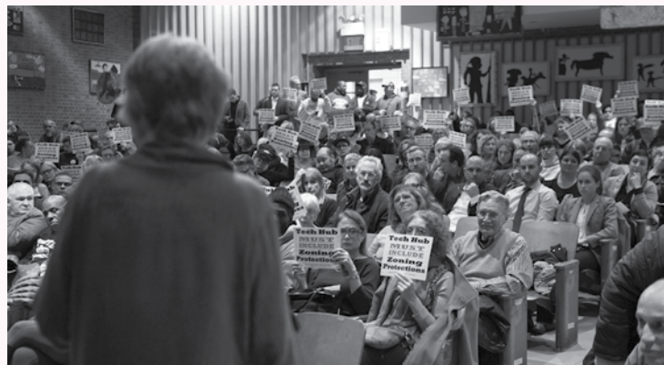
GVSHP members turned out in force at public hearings to demand the Mayor's Tech Hub include neighborhood protections.