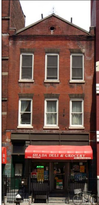
157 Christopher Street