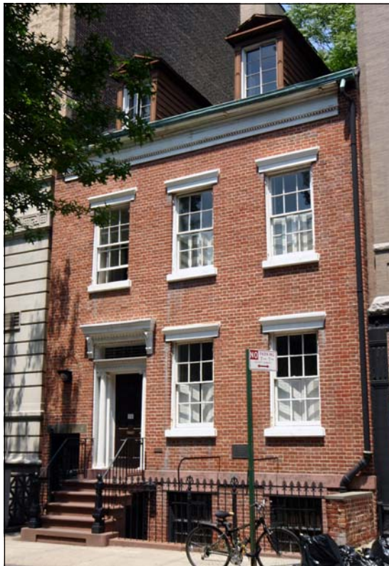
131 Charles Street