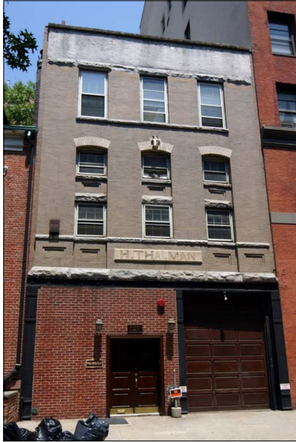
129 Charles Street