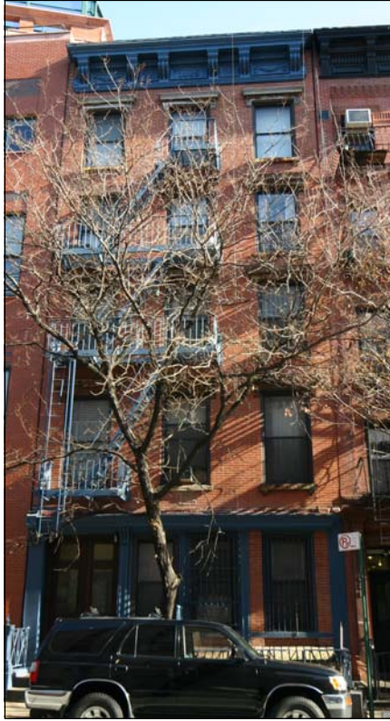
661 Washington Street

663-665 WASHINGTON STREET (aka 278-280 WEST 10 TH STREET) Tax Map Block 630, Lot 9