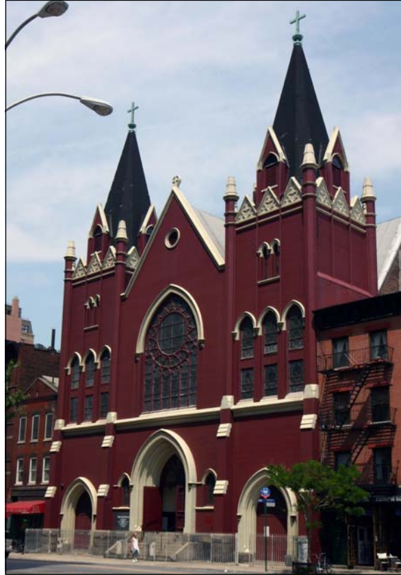
149-155 Christopher Street