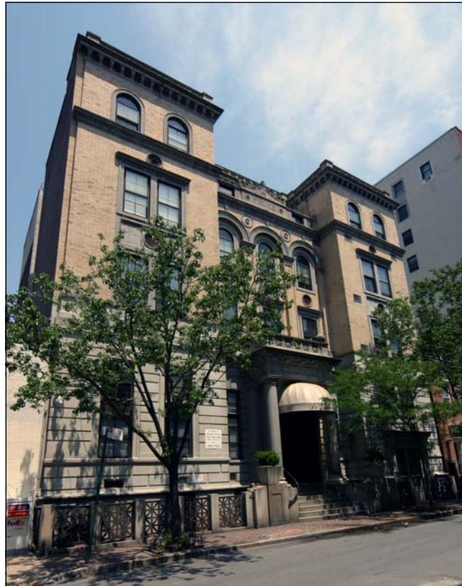
133-137 Charles Street