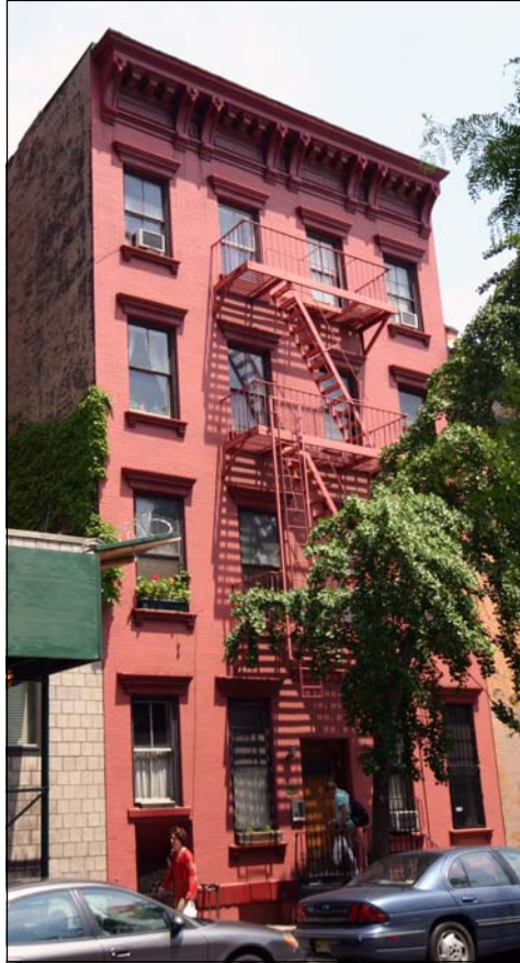
273 West 10th Street