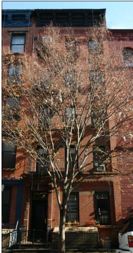
659 Washington Street