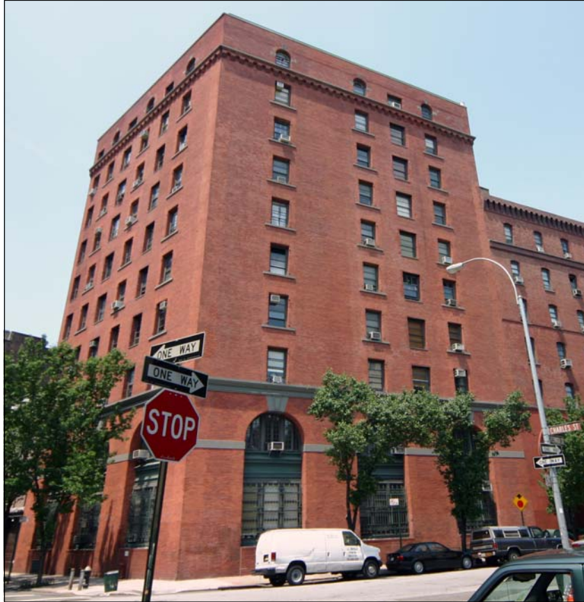
720-724 Greenwich Street aka 125-127 Charles Street