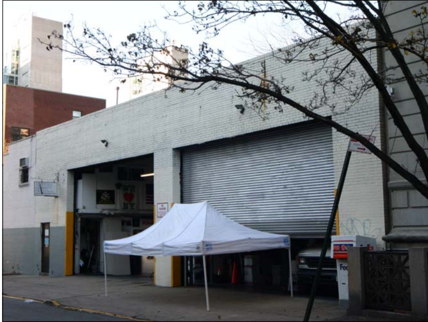
139-141 Charles Street