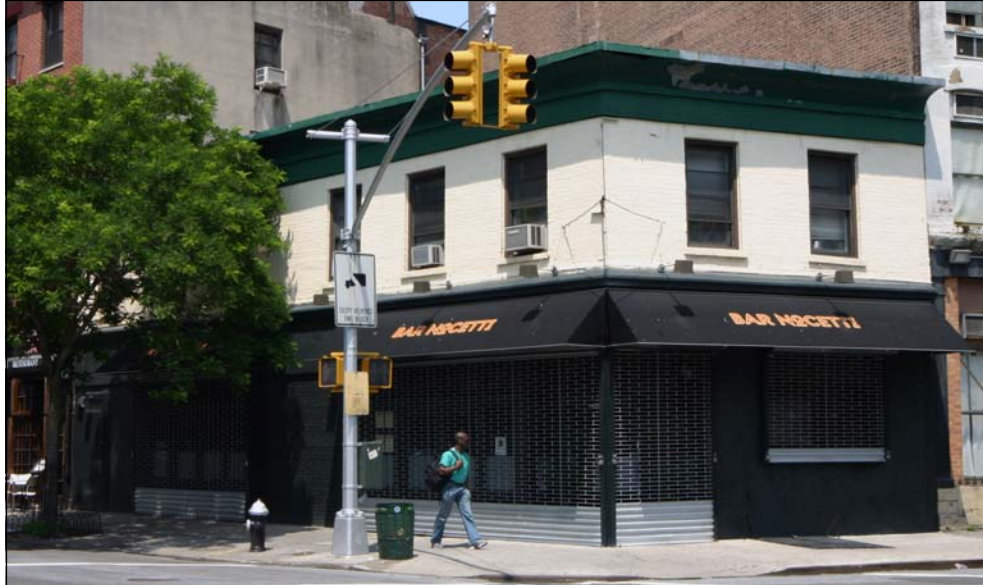
143-145 Christopher Street aka 684 Greenwich Street