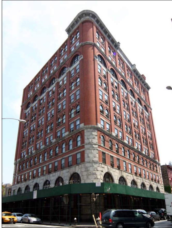
277-283 West 10th Street aka 667-675 Washington Street