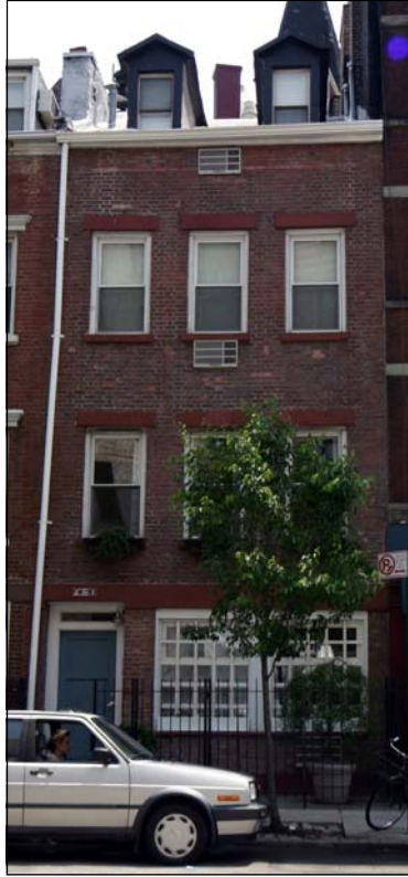
651 Washington Street