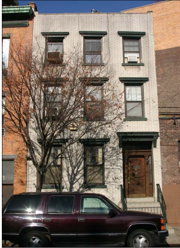
269 West 10th Street