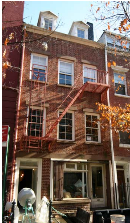
655 Washington Street