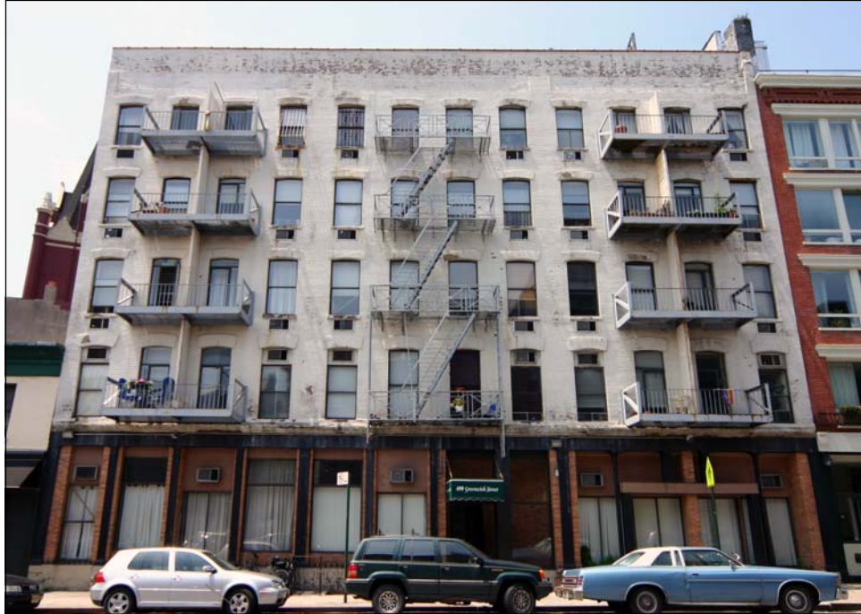
686-690 Greenwich Street