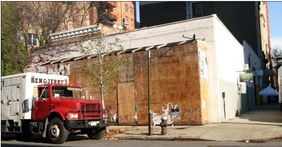
685-687 Washington Street aka 143-145 Charles Street