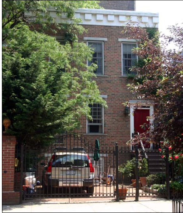
689 Washington Street