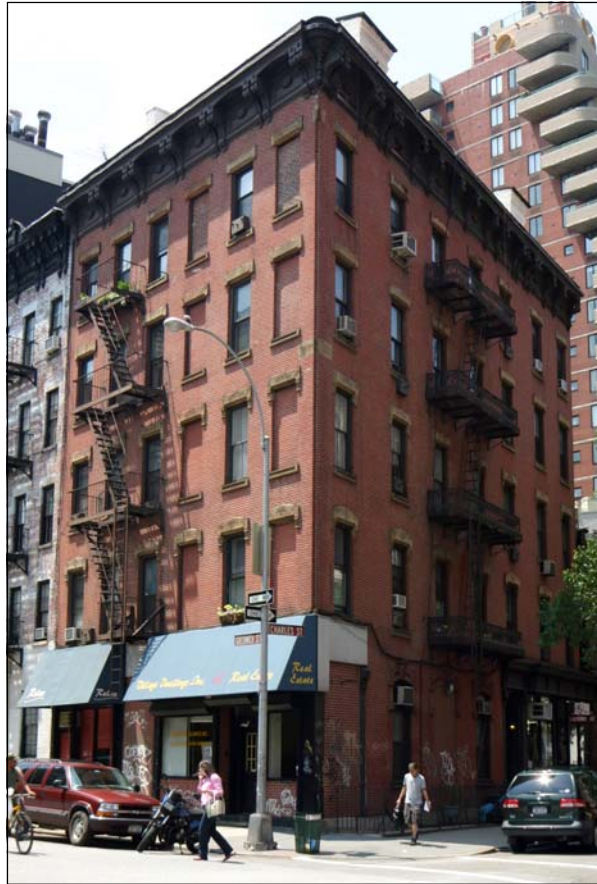
716-718 Greenwich Street aka 128 Charles Street