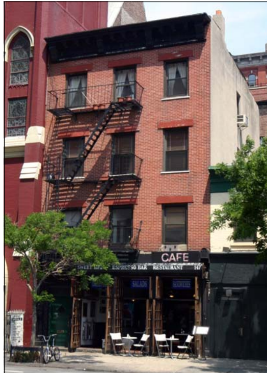
147 Christopher Street

Photographs : NYC, Dept. of Taxes (c. 1939); LPC, John Barrington Bayley (1964); LPC (2005); Greenwich Village Society for Historic Preservation (1988, 2005).