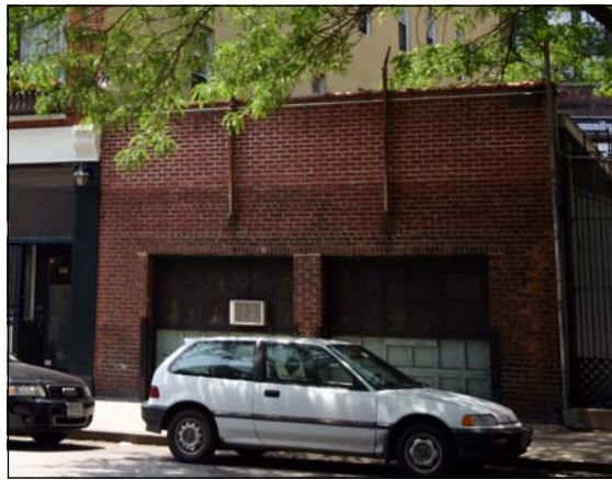
694 Greenwich Street