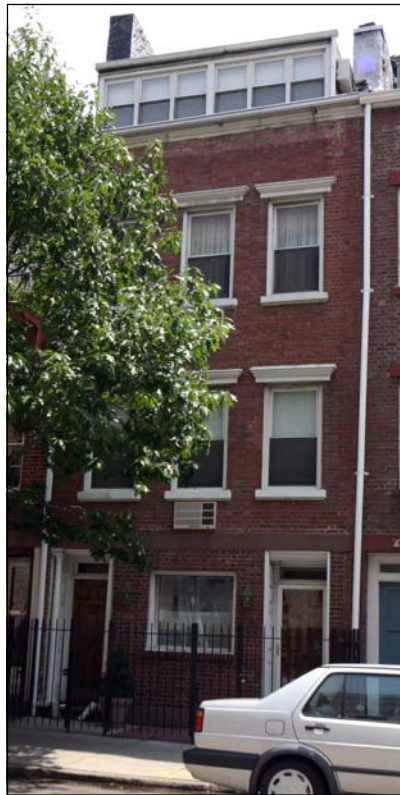
653 Washington Street