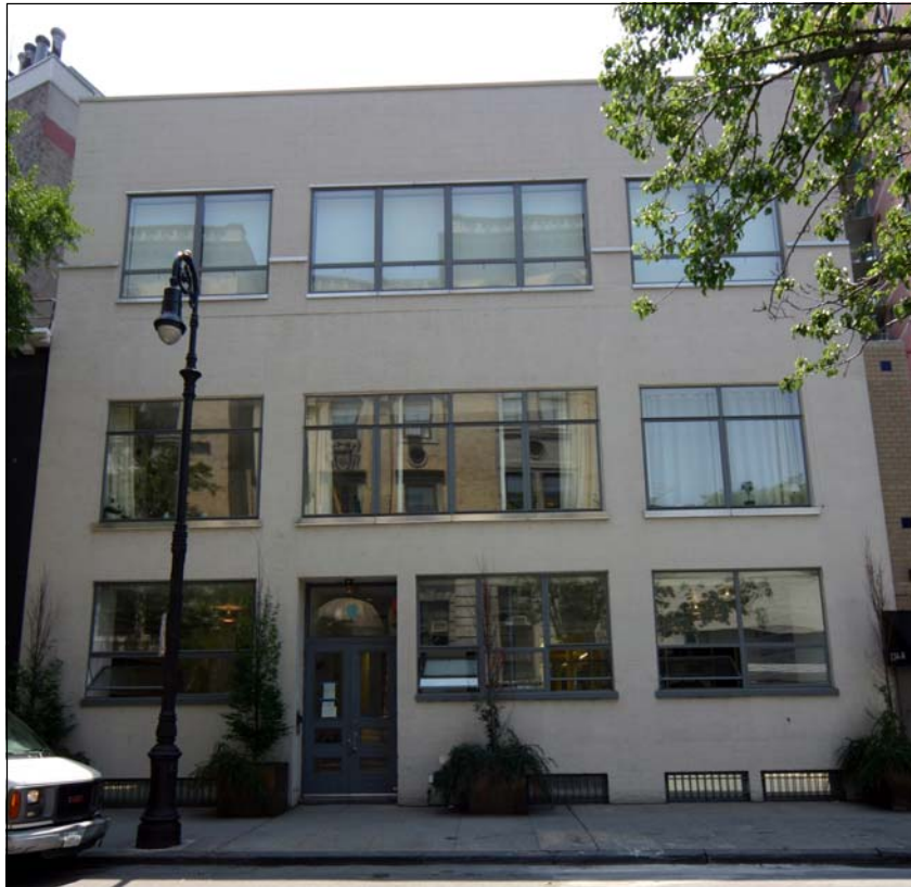
134-136 Charles Street

Kellerman; NY County, Office of the Register; NYC, Buildings Dept.; NYC Directories (1896-1934); Manhattan Address Directories (1929-76); "The Real Estate Field," NYT , July 18, 1911, 13; "Real Estate Transfers," NYT , Sept. 9, 1911, 16, and Oct. 26, 1911, 16; "Picks Subway Insignia," NYT , Aug. 19, 1932, 2; "Tenements Bought to be Modernized," NYT , May 19, 1938, 39; "Manhattan Transfers," NYT , May 21, 1938, 26; "Building Plans Filed," NYT , June 23, 1948, 46; "Truck Terminal Sold Downtown," NYT , Mar. 1, 1962, 51; "A Stamp Collection Valued at $100,000 is Sold by Chrysler," NYT , Mar. 2, 1967, 32; "Antiques: Roll-Top Desks....," NYT , Feb. 24, 1973, 65; "Jennifer Bartlett Creates an Archetypal New Found Land," NYT , May 23, 1982, 95; "Art: the Unexpected from Jennifer Bartlett," NYT , Apr. 12, 1985, C23; "Memphis on Charles St.," NYT , June 23, 1985, R1; Walter P. Chrysler, Jr. obit., NYT , Sept. 19, 1988, B10.