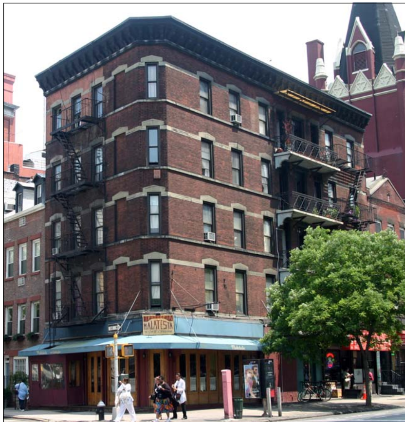
159-163 Christopher Street aka 649 Washington Street