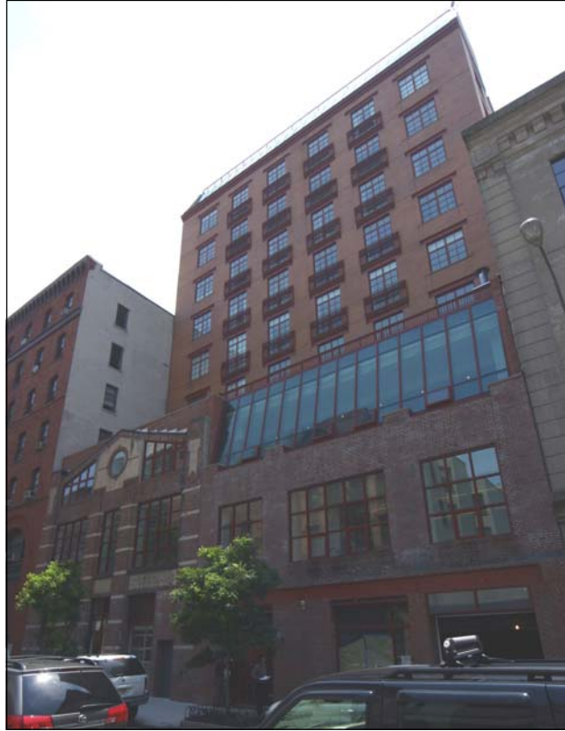
132-138 Perry Street