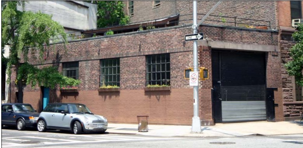
702 Greenwich Street aka 267 West 10th Street

Kellerman; NY County, Office of the Register; NYC, Buildings Dept.; Manhattan Address Directories (1940-76); "Manhattan Transfers," NYT , Dec. 14, 1936, 45; "Building Plans Filed," NYT , June 5, 1937, 30; "Manhattan Parcels in Leasehold Deals," NYT , June 25, 1937, 41; "Operators Active on the West Side," NYT , Mar. 21, 1947, 37; "'Village' Parcels Figure in 6 Deals," NYT , Apr. 23, 1947, 43; "Manhattan Transfers," NYT , May 1, 1947, 44, and Mar. 15, 1949, 48; "Properties Sold in 'Village' Area," NYT , Feb. 4, 1955, 35; "Manhattan Transfers," NYT , Feb. 21, 1955, 33; "These Are a Few of My Favorite (Village) Things," NYT , Jan. 10, 1997, C30.