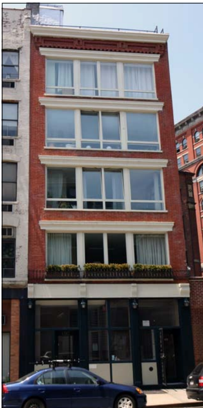
692 Greenwich Street