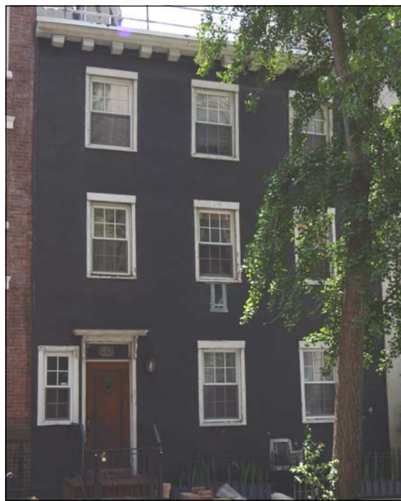
132 Charles Street