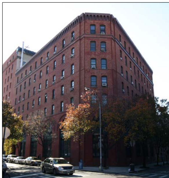
726-736 Greenwich Street aka 124-130 Perry Street