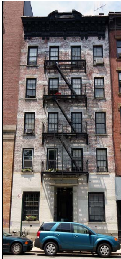
714 Greenwich Street