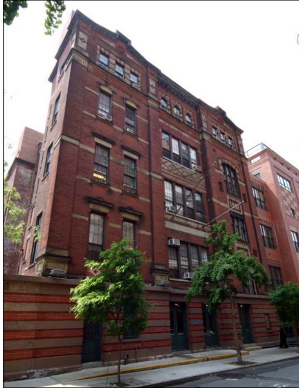
272 West 10th Street aka 696-700 Greenwich Street