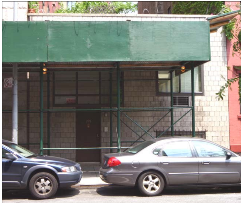
275 West 10th Street

Kellerman; NY County, Office of the Register; NYC, Buildings Dept.; "Truck Terminal Sold Downtown," NYT , Mar. 1, 1962, 51; "Garage in 'Village' Burns," NYT , Feb. 15, 1971, 24.