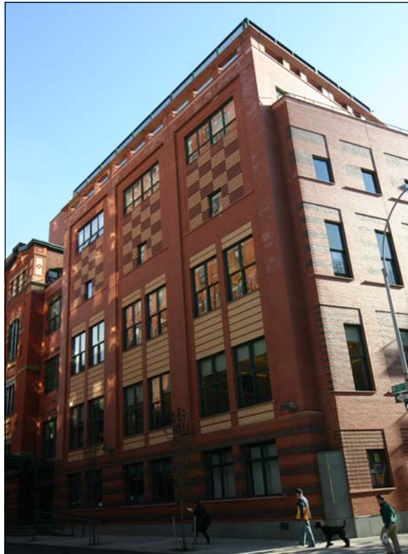
278-280 West 10th Street aka 663-665 Washington Street