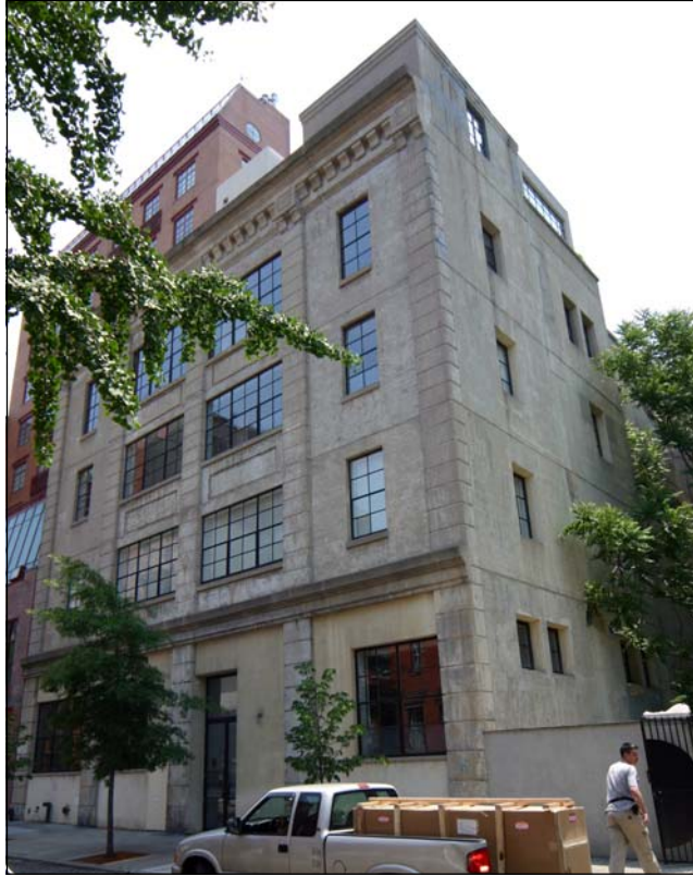
140-144 Perry Street