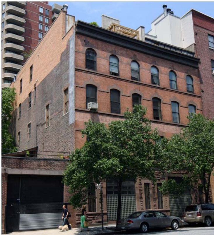
704-706 Greenwich Street

Exceed New Apartment Construction,” NYT , Oct. 12, 1980, R1.