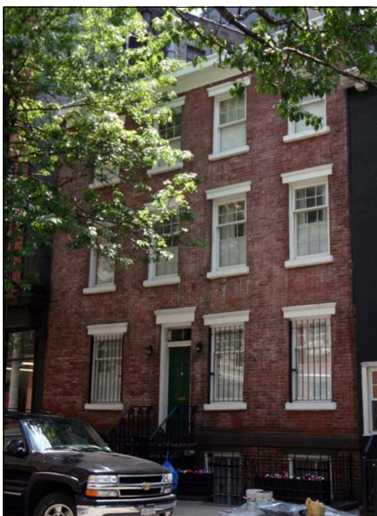
130 Charles Street