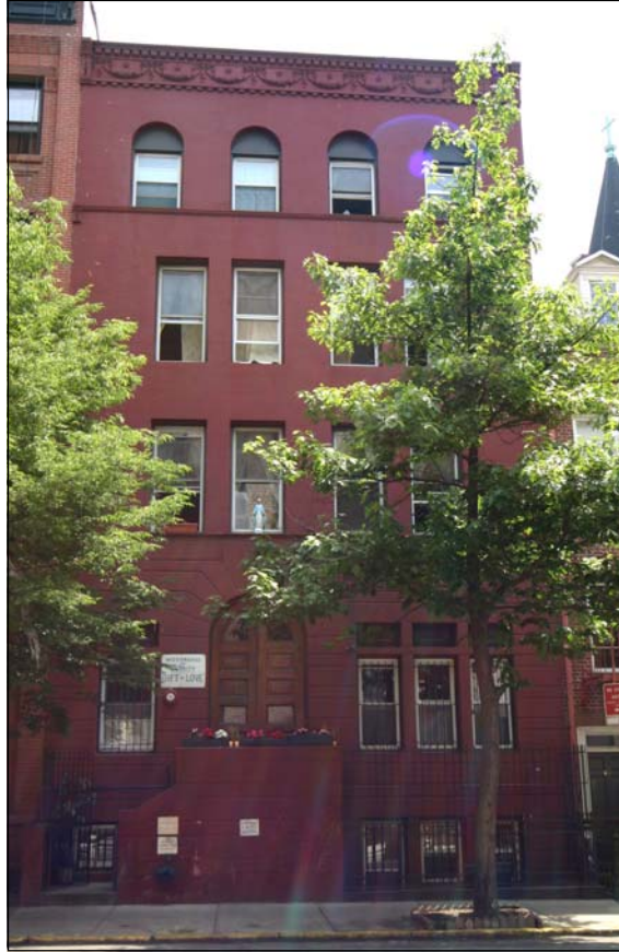
657 Washington Street