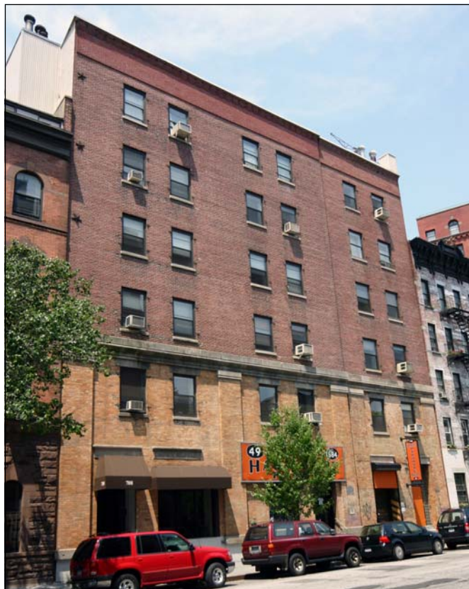
708-710 and 712 Greenwich Street