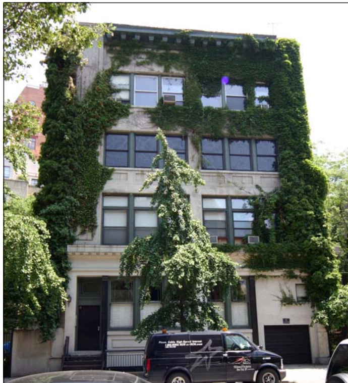
695-701 Washington Street aka 146-148 Perry Street