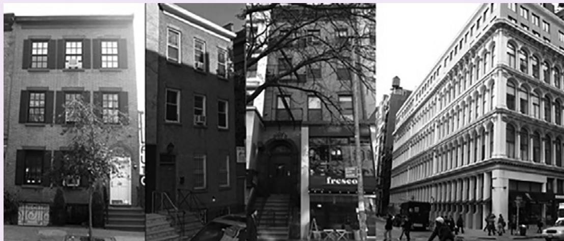
(l. to r.) 57 Sullivan Street, 2 Oliver Street, 138 Second Avenue, and 801 Broadway.

Each year, we add two new plaques throughout the Village, East Village, and NoHo. Past plaques have included the site of the former Fillmore East, beat mecca the San Remo Café, and the home of poet Frank O'Hara. Find out more and watch footage of plaque unveilings at gvshp.org/plaque .