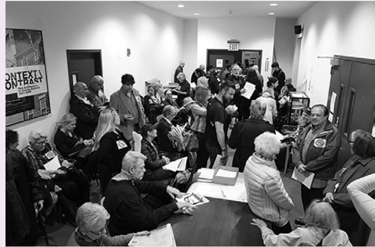
The standing room-only crowd at the Landmarks hearing on the proposal.

But as GVSHP pointed out at the LPC hearing, this proposal is not change; it is obliteration. The proposed new buildings and additions would utterly overwhelm the street and the district, fundamentally destroying its character. The buildings to be demolished and built on top of make important contributions to the district, and should not be compromised in this manner.