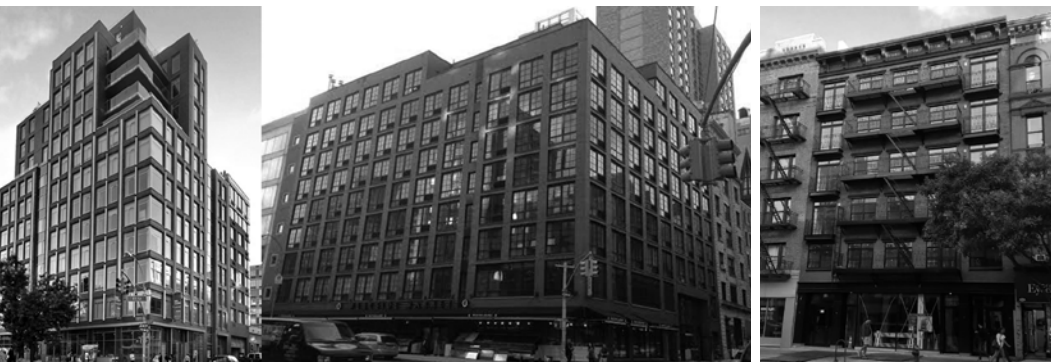
Under the Mayor's zoning proposal, these three new buildings in contextual zones in the East Village could have been built 25 to 35 feet taller.

GVSHP is strongly opposed to such an approach. We believe that promoting affordable housing and maintaining neighborhood scale and character are both important priorities, and the City's approach needlessly puts these two goals at cross-purposes. Like ZQA, MIH's fate will be decided at the City Council this spring. More info and how to help at gvshp.org/zqamih .