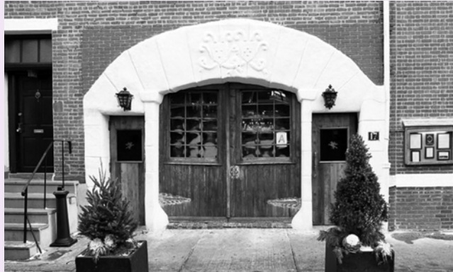
The beloved archway at One If By Land.

Soliciting nominations from the public, each month we select one business to highlight and