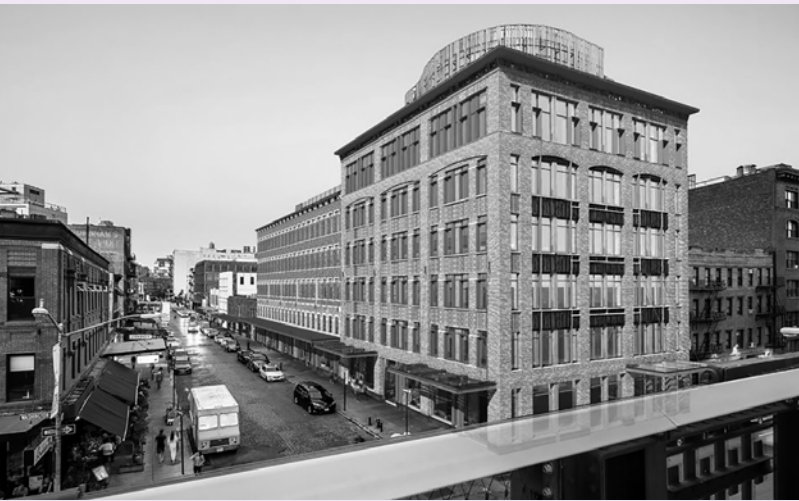
The proposed new construction on Gansevoort Street would replace 1-2 story historic market buildings.

In November, GVSHP, fellow community and preservation groups, local elected officials and the Community Board showed up en masse at a Landmarks Preservation Commission (LPC) public hearing to oppose a proposal for demolition of two buildings on Gansevoort Street, construction of two new ones, and large-scale additions to a third. Though the street currently consists exclusively of one-to-two story historic meat market buildings, one of the new buildings would reach 120 feet in height, while the additions to another would nearly triple its height. The plan requires landmarks approval because in 2003 GVSHP proposed and secured landmark status for this street and much of the Meatpacking District.