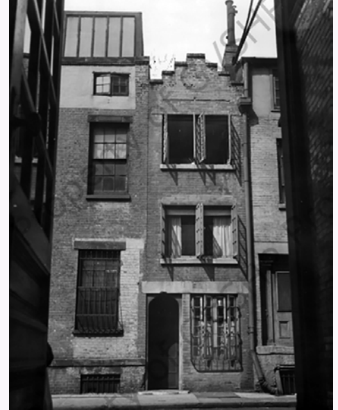
75 ½ Bedford Street

These latest oral histories join our long-standing collections focused on Village 'Preservation Pioneers' and the origins of the Westbeth Artists complex. The former include interviews with Jane Jacobs