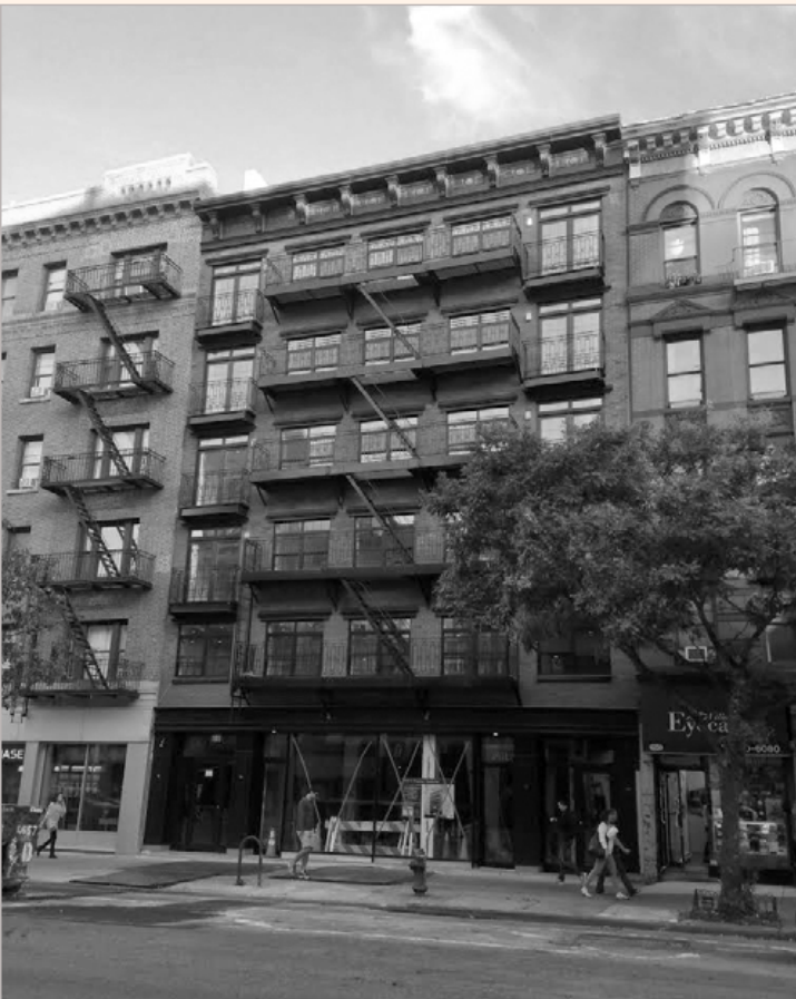
This new development on 2nd Avenue in the East Village lines up perfectly with its surroundings under existing contextual rezoning. Under the city's plan, a development here could be nearly twice as tall.

And the City claims that increasing the height limits for “inclusionary” developments will result in more developers choosing to opt into this voluntary program (where 20% of units in new developments are rent- and income-restricted in exchange for the developer receiving a one-third increase in allowable floor area) and thus more affordable housing will be built.