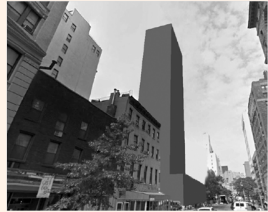
Image of the approximate size and massing of the planned tower at Bowlmor site.

That's exactly what's planned for the Bowlmor site at University Place and 12th Street, where demolition is underway and a 308 ft. tall tower is set to replace it. In response, GVSHP is pushing for a rezoning of the area with reasonable height limits, and is studying the area for possible landmark proposals.