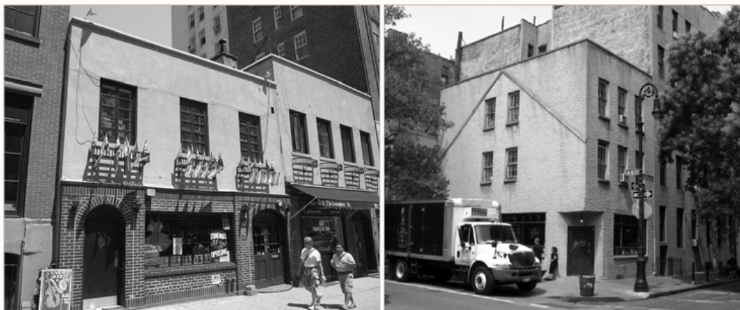
(l. to r.) Stonewall Inn, 51-53 Christopher Street; Julius Bar, 159 West 10th Street

This year, after a letter-writing campaign and a planned press conference in front of the Stonewall, the City finally announced in late May the site would be considered for landmark designation. As we go to press, a final vote on landmarking has not yet been set, and no commitment has yet been made on the three other sites. If designated, Stonewall would be the first site landmarked by New York City primarily for significance to LGBT history. Great progress is being made, but we still have more to do.