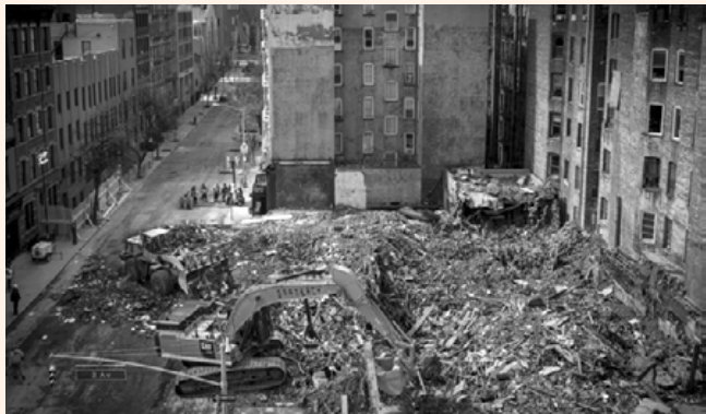
The sad aftermath of the explosion at 2nd Avenue and 7th Street.

At some point the long process of rebuilding those sites will begin. Fortunately, due to the contextual rezoning and landmarks protections we were able to help secure in recent years for this site and much of the East Village, any new development will be limited in height and scale, and have to go through a landmarks review process to ensure it is compatible with its historic surroundings. GVSHSP will notify the public about the hearings on any such application for new development on the site and how to weigh in, and will advocate for maintaining the qualities which make the East Village so special.