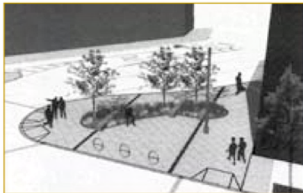
City's plan for the Jane Street Triangle.

Rudin's condo proposal remains unchanged from a prior version connected to St. Vincent's plan for a new hospital, before the hospital's mismanagement and bankruptcy put an end to that plan. Rudin's proposal, previously approved by the Landmarks Preservation Commission (LPC), would preserve and re-use the four oldest of the eight former St. Vincent's buildings east of 7th Avenue, while demolishing and replacing the four newest with new housing. While