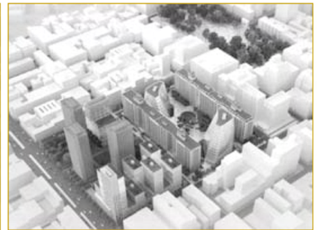
(l.) After an enormous public outcry and protests led by GVSHP, NYU dropped a proposal to build the Village's tallest building on Bleeker Street (in white, on left in model); (r.) an aerial view of the massive development NYU now proposes to shoehorn in south of Washington Square Park.