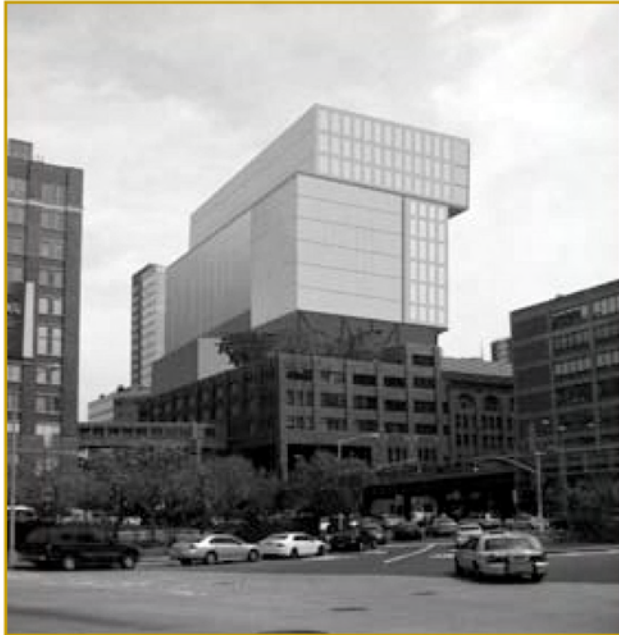
The proposed massive addition to the western end of Chelsea Market

Given its important history and impressive architecture, GVSHP included the Chelsea Market complex in our proposed Gansevoort Market Historic District submitted to the City in 2001. Though the City initially encouraged