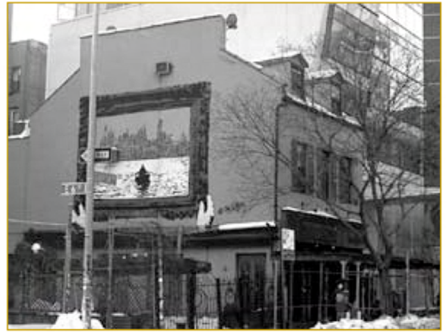
101 Avenue A (l.) is one of several buildings GVSHP and allied groups were able to convince the City to add to the proposed East Village Historic District; 35 Cooper Square (r.), however, fell victim to the wrecking ball after the City refused to landmark it.

now houses the Anthology Film Archives, and several wonderfully intact early 19th century rowhouses and late 19th century tenements. The LPC is expected to calendar, or begin to formally consider landmark status for, the districts in June, putting some preliminary protections in place.