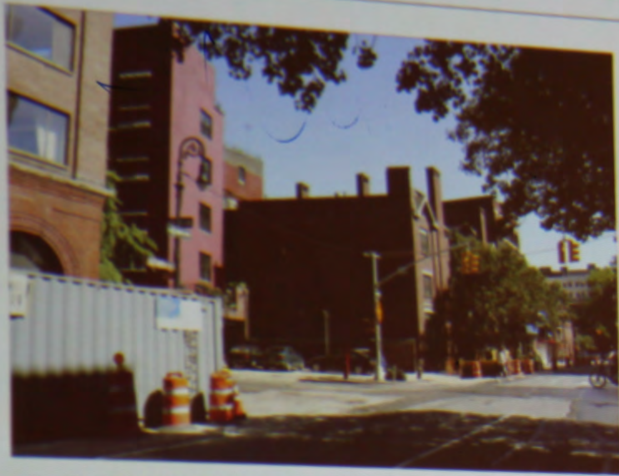
3 VIEW SOUTH FROM THE PUBLIC WAY