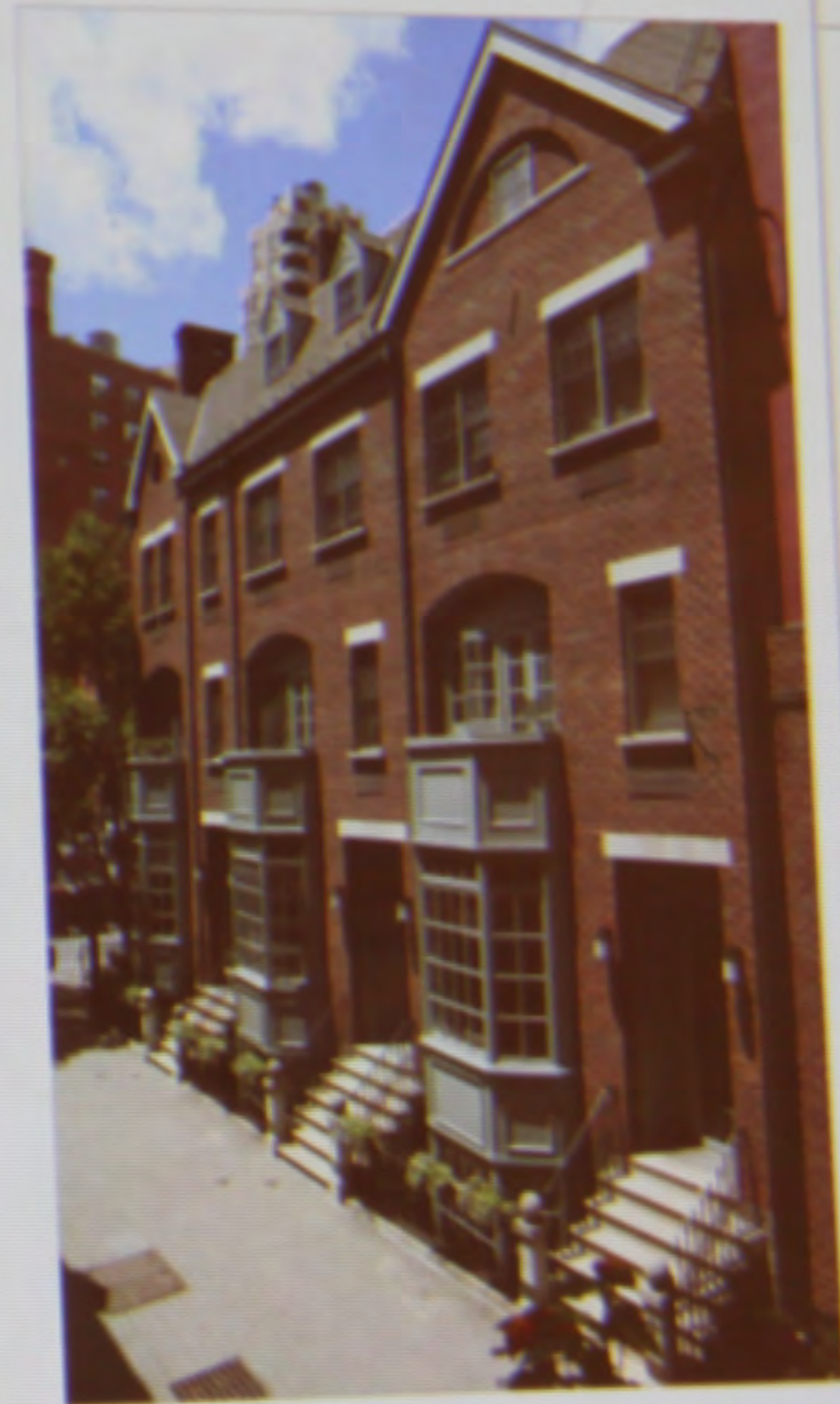
5 VIEW OF FRONT FACADE