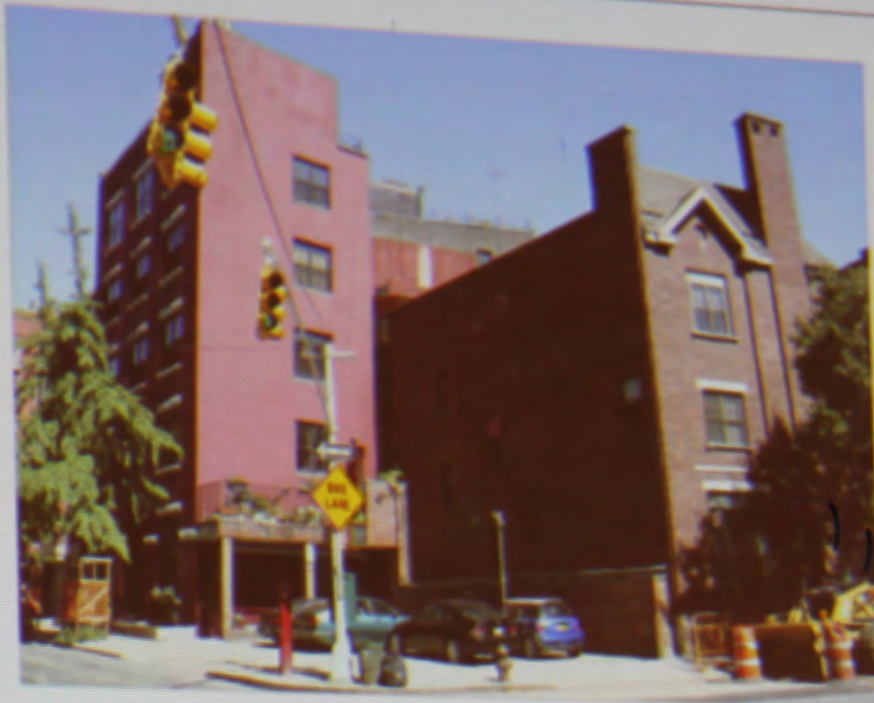
4 VIEW FROM THE PUBLIC WAY