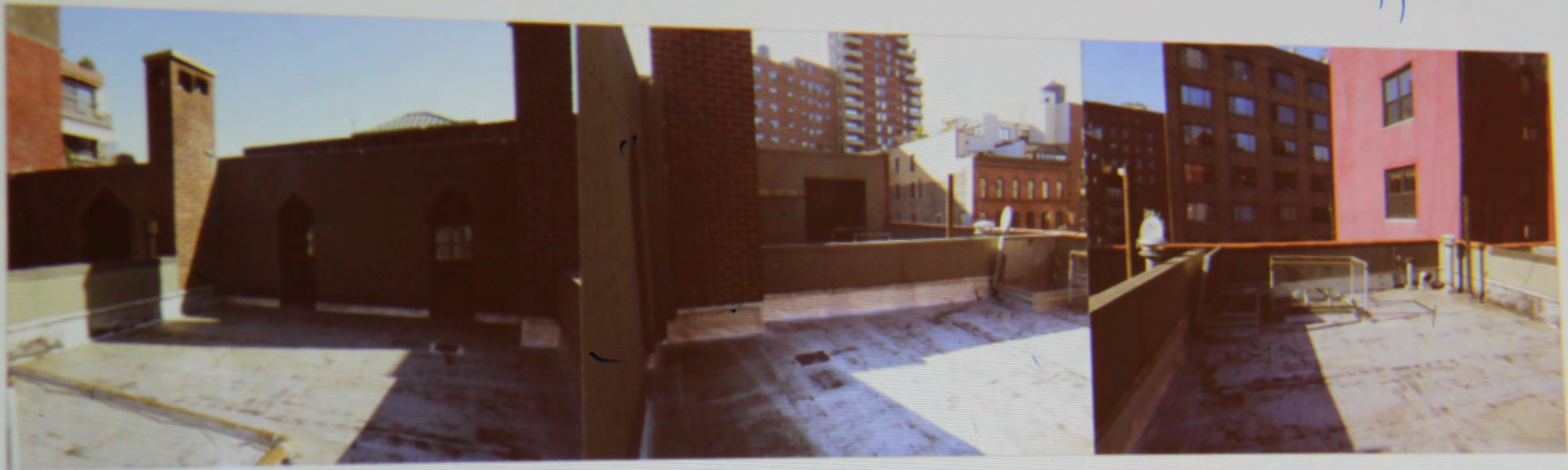
1 ROOF LOOKING SOUTH Scale: 1/8" = 1'-0"