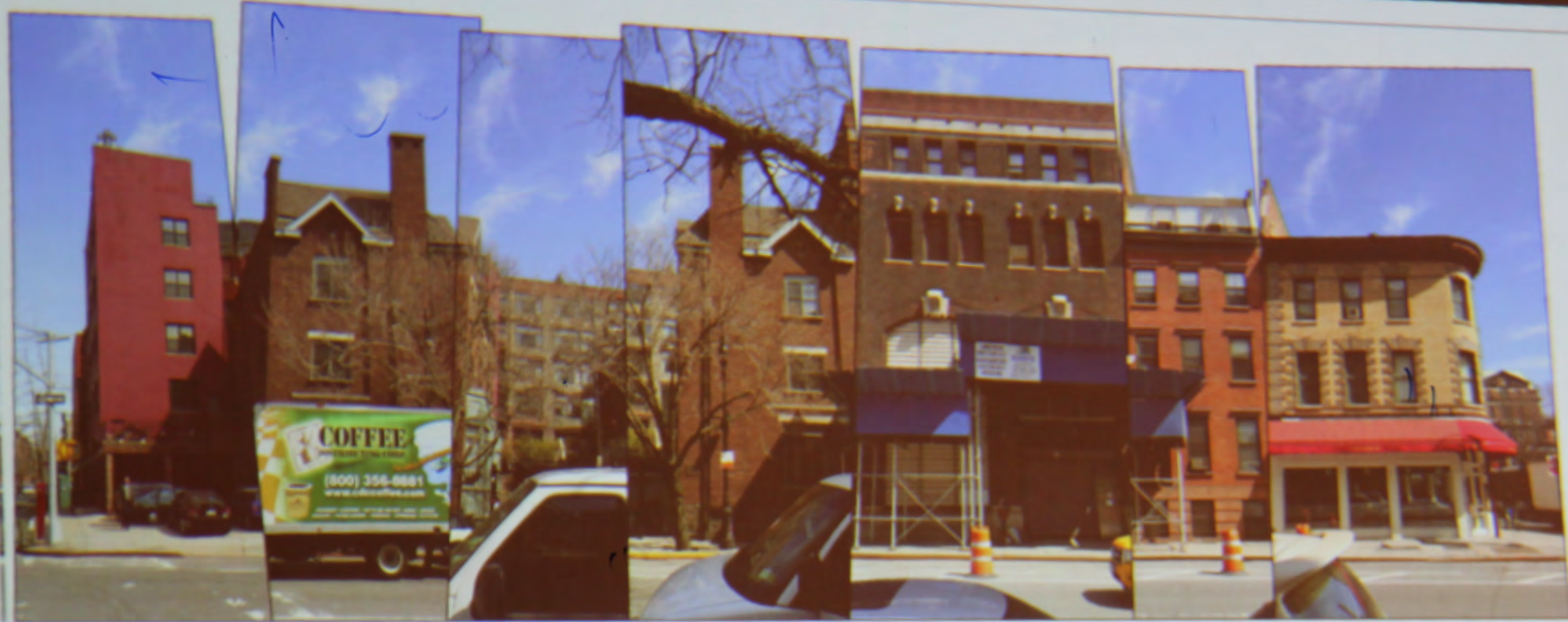
① GREENWICH STREET - West 10th to Christopher