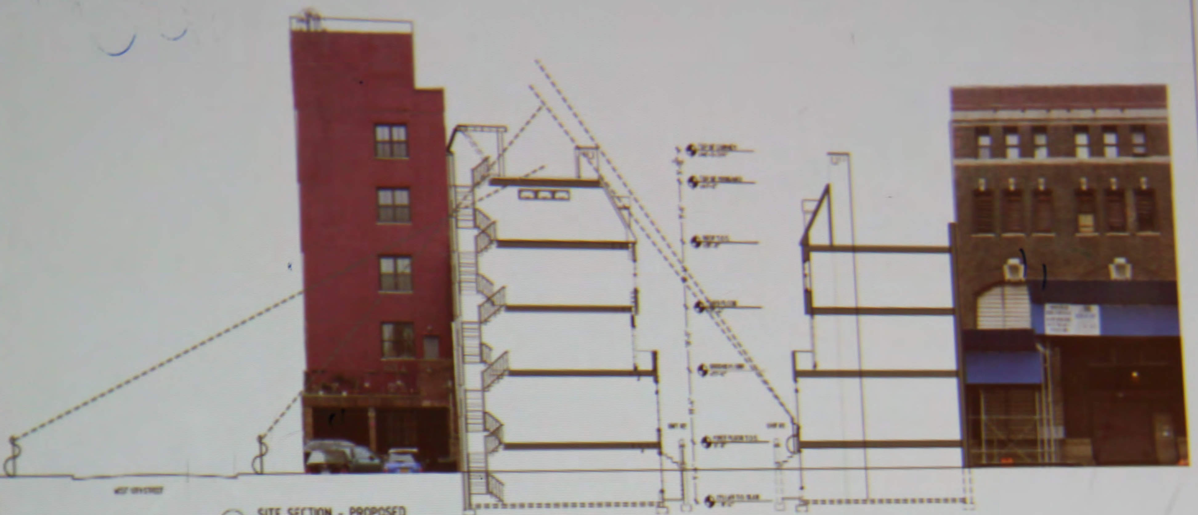
2 SITE SECTION - PROPOSED Scale 1/8" = 1'-0"