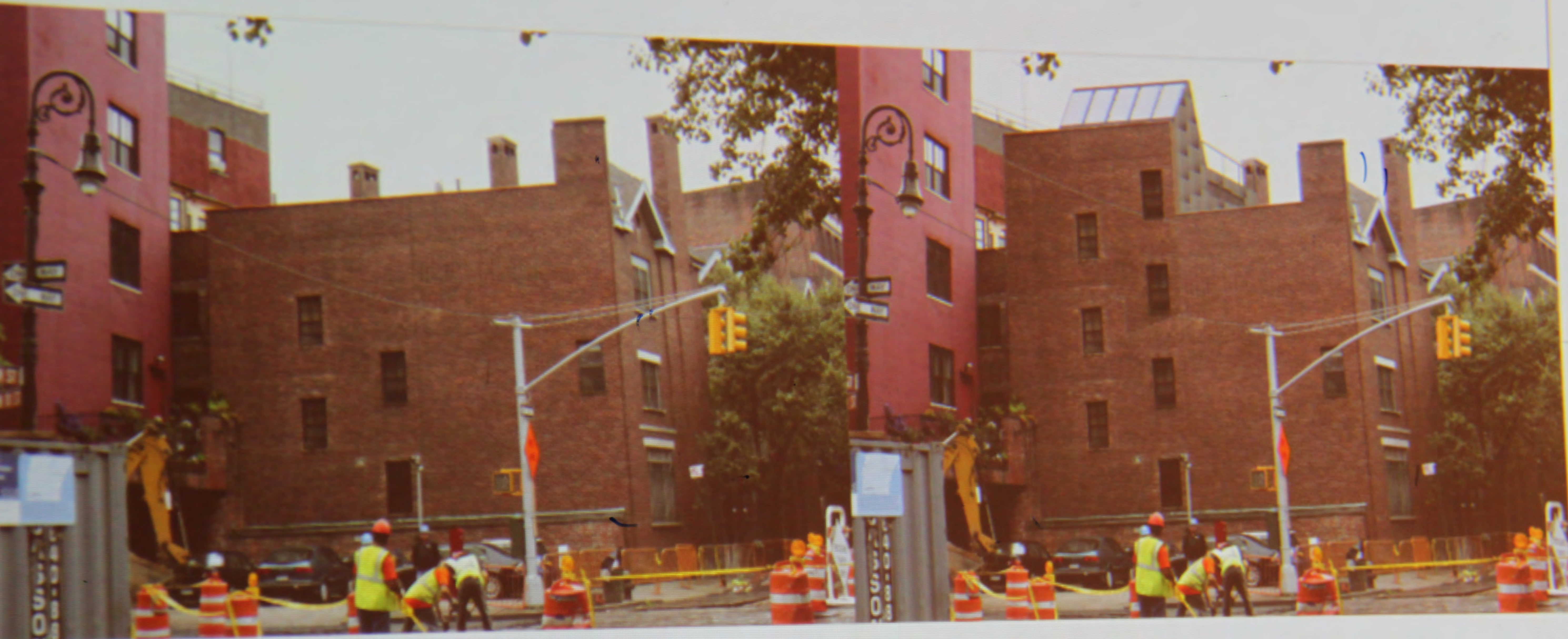
1 VIEW FROM 10th + GREENWICH STREETS Scale: none