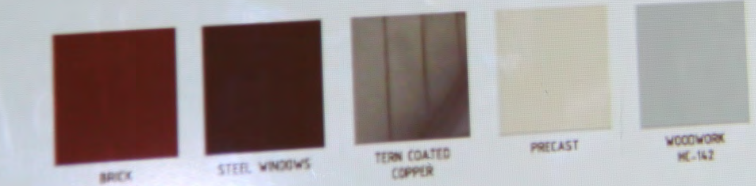
3 COLOR PALET Scale: 1/8" = 1'-0"

HABERMAN RESIDENCE - 48th Greenwich Street - New York, NY 10018 NORTH ELEVATION PROPOSED