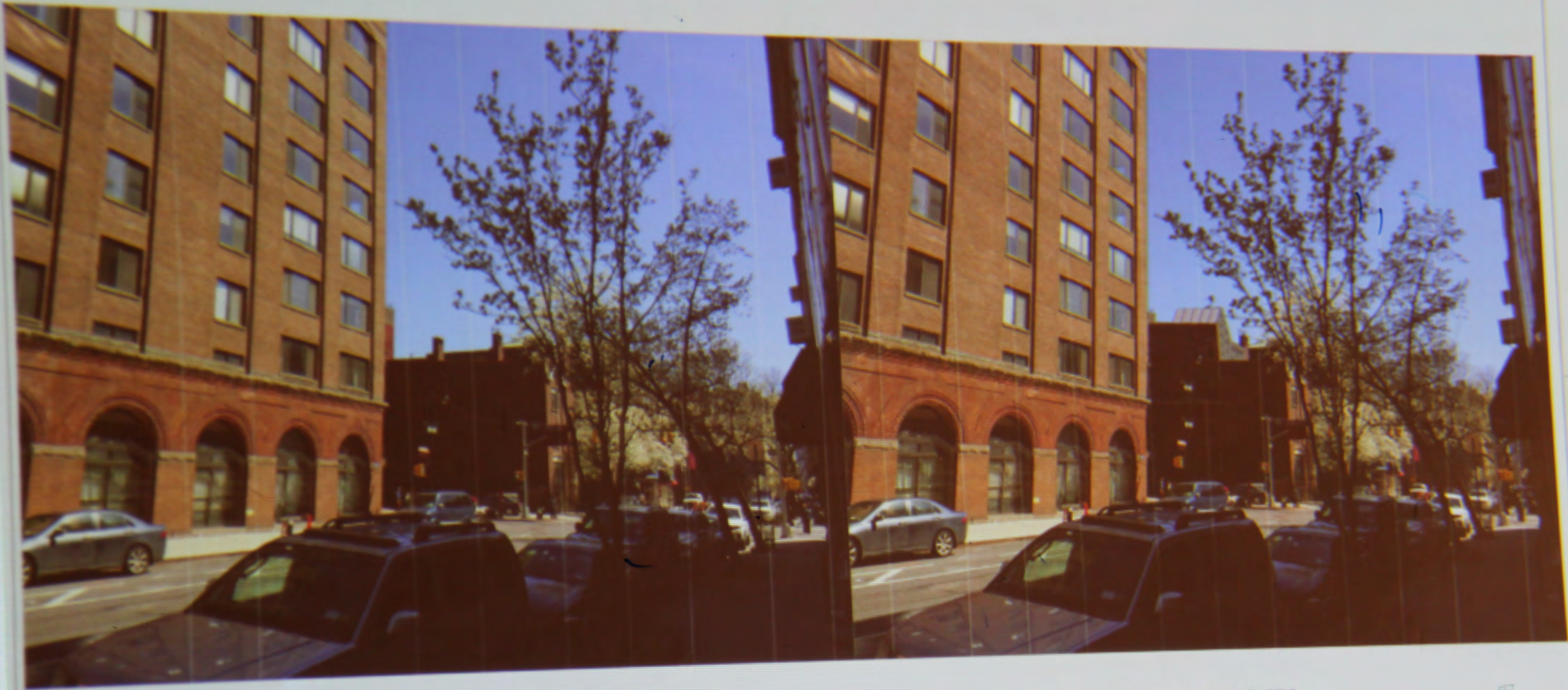
1 VIEW FROM 10th + GREENWICH STREETS Scale: 1/8" = 1'-0"