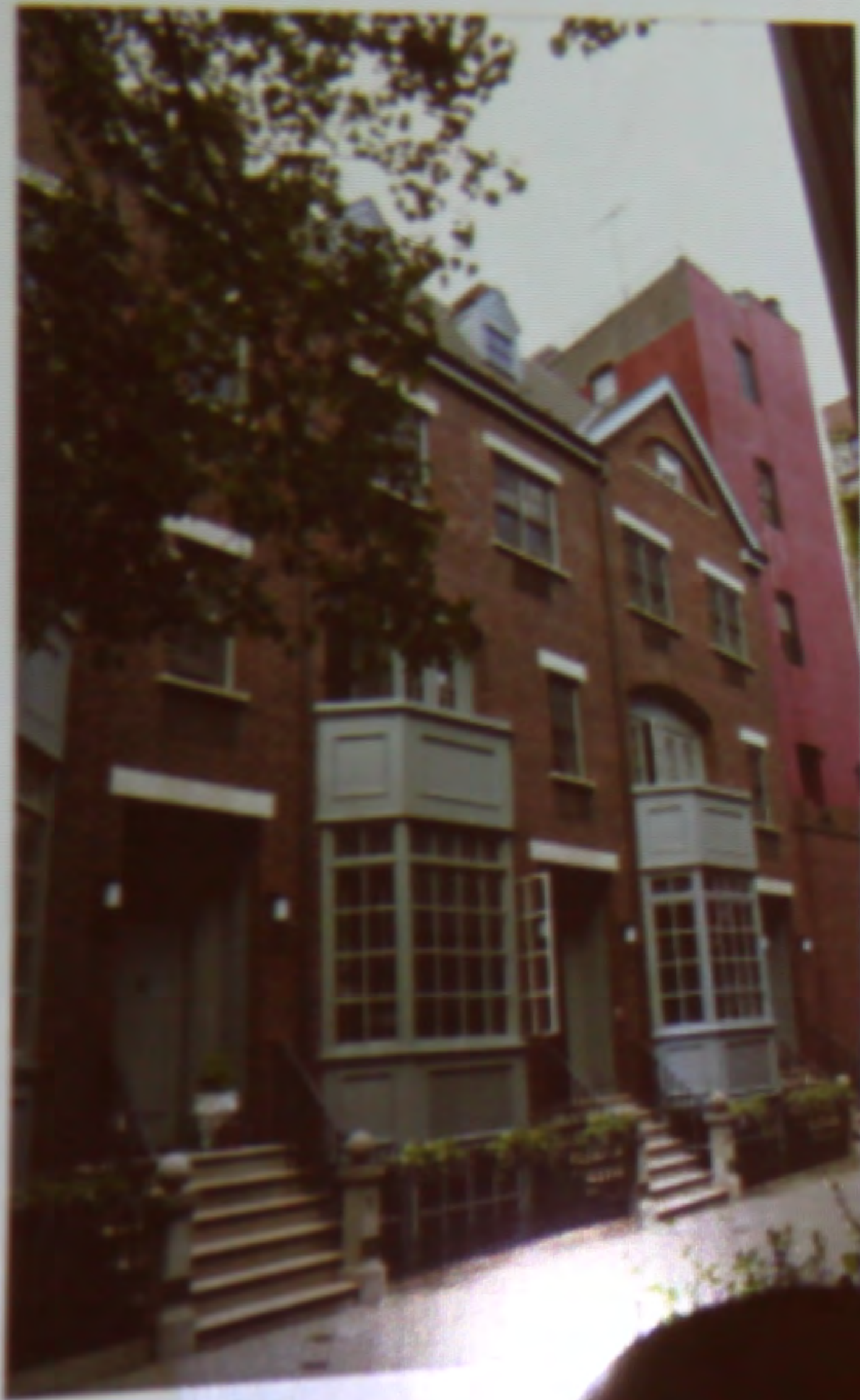
VIEW FROM THE PUB...