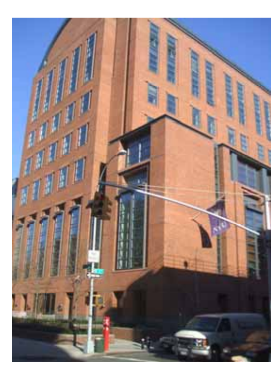
Furman Hall (2004) 79 West Third Street 173,540 sq. ft.