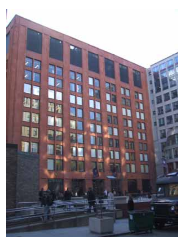
Tisch Hall (1972) 40 West 4th Street 113,940 sq. ft.