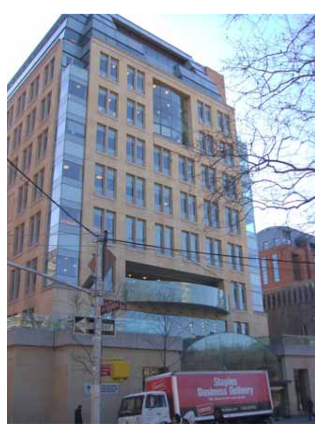
Kimmel Center (2003) 60 Washington Square South 210,500 sq. ft.