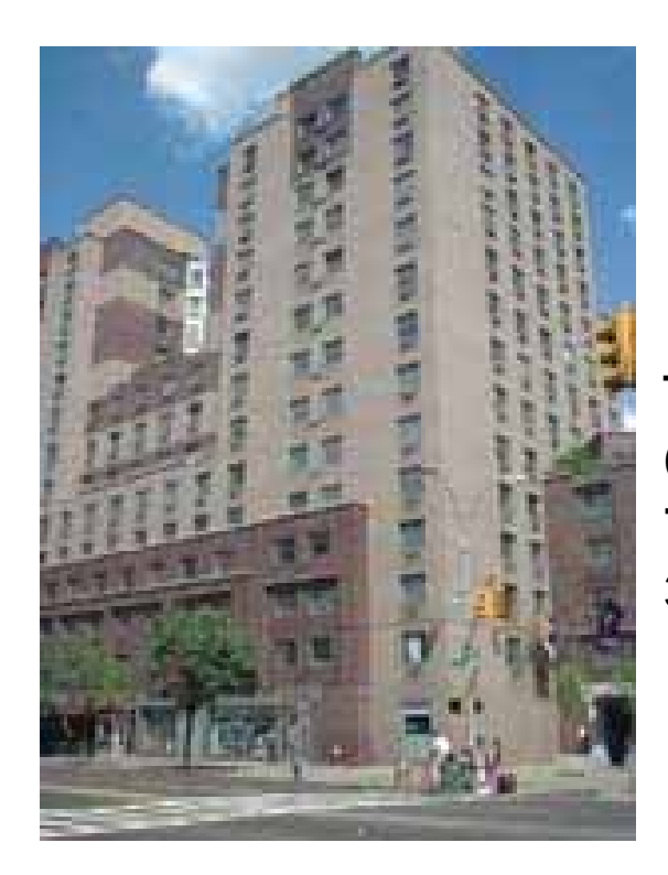
Third Avenue North Dormitory (1986) 75 Third Ave 337,600 sq. ft.