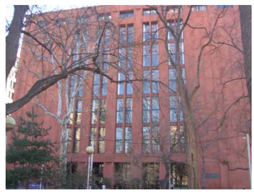
Bobst Library (1973) 70 Wash. Sq. So. 470,400 sq. ft.