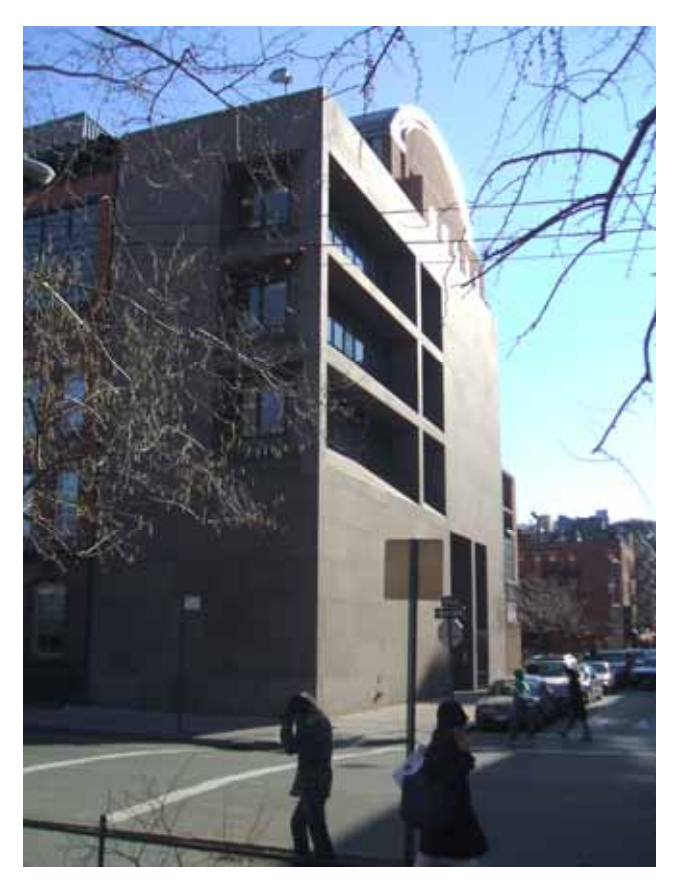
Kevorkian Center (1972) 50 Wash Sq. So 10,000 sq. ft.