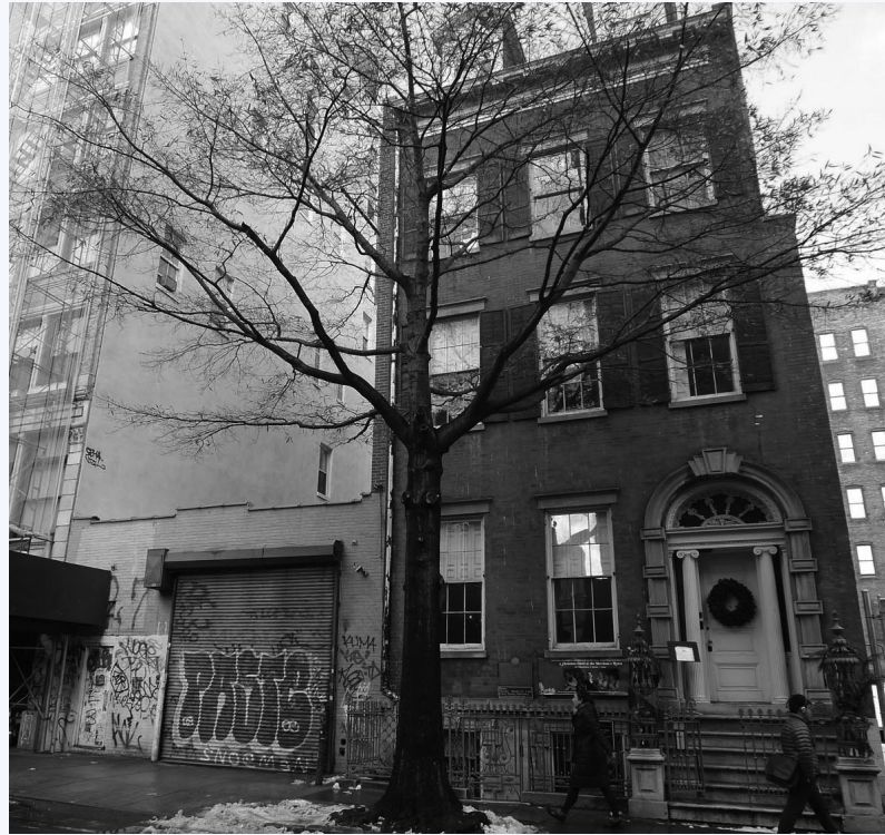
The Merchant's House Museum, with 27 E. 4th Street to its left.

reflects a fundamental failure on the part of city government. The Museum is owned by the City of New York and is located on city-owned land. Millions of dollars in city funding have gone into its upkeep, restoration, and operation. And yet city agencies like the City Planning Commission and the Landmarks Preservation Commission have approved plans for construction next door that would endanger the Museum and potentially cause millions of dollars in damage and deprive the public of access to this irreplaceable educational, historic, and cultural resource. This is a clear failure on the part of our leaders to appropriately value preservation or the indispensable resource which an institution like the Merchant's House Museum provides to the entire city.