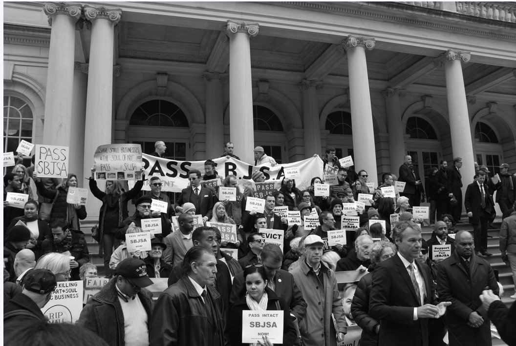
GVSHP was part of a broad coalition which turned out at City Hall to call for the passage of the SBJSA.

GVSHP is also working with advocates in the East Village to pursue 'Special District' zoning regulations that would limit the location of chain stores. Such measures have never been implemented in New York City, but have in other municipalities. For a variety of reasons the East Village would be an ideal place to introduce such a measure, including because