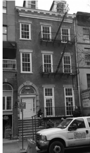
PLANNED OFFICE TOWER AT 3 ST. MARK'S PLACE (L.) AND LANDMARKED HOUSE AT 4 ST. MARK'S PLACE FROM WHICH A DEVELOPER WISHES TO TRANSFER AIR RIGHTS