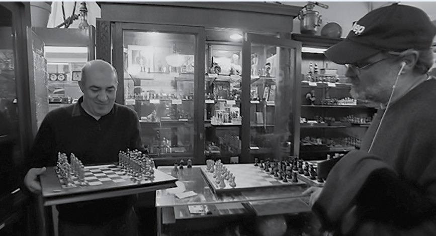
CHESS FORUM, FEATURED IN OUR SMALL BUSINESS VIDEOS