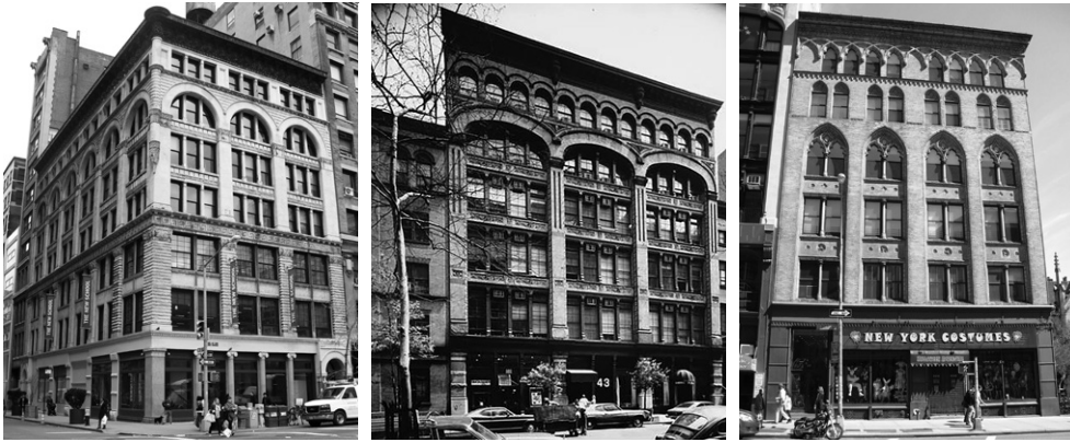
SOME OF THE MANY HISTORIC BUILDINGS IN THE AREA THE CITY HAS SO FAR REFUSED TO RECOGNIZE WITH LANDMARK DESIGNATION: (L. TO R.) 72 FIFTH AVENUE, 43-47 EAST 10TH STREET, AND 808 BROADWAY.