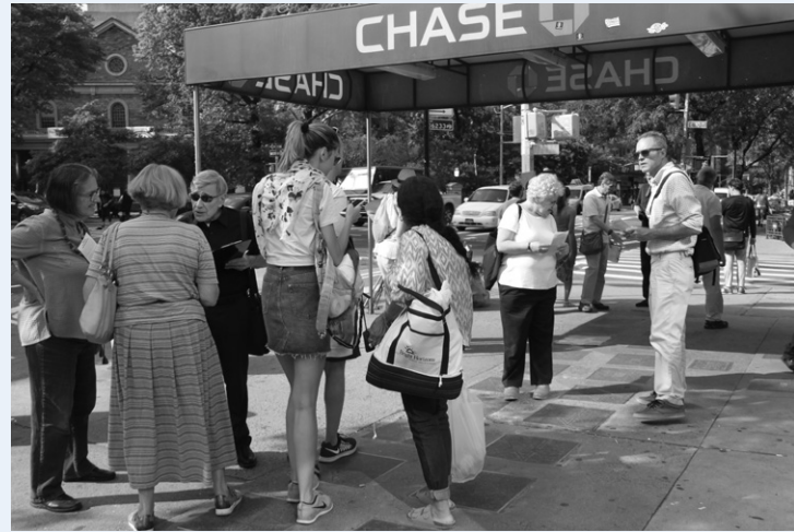
VILLAGE PRESERVATION DID PUBLIC OUTREACH TO CALL ATTENTION TO THE PLIGHT OF THE YIDDISH WALK OF FAME, NOW LOCATED OUTSIDE A CHASE BANK.

As a 501C3, we cannot and do not endorse or oppose candidates for public office. However we can and do endorse or oppose ballot measures and proposed legislation, and can ask candidates for and publicize their positions on issues of concern to us, and educate the public about elected officials' and candidates' records and positions. We strongly encourage the public and our members to access this information and educate themselves, and to vote at election time.