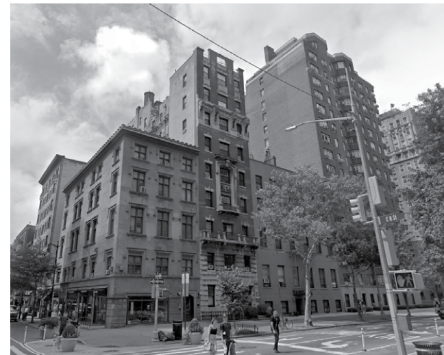
14-16 FIFTH AVENUE IS THE FIVE-STORY BUILDING IN THE CENTER. A DEVELOPER WANTS TO REPLACE IT WITH A 244 FT. TALL TOWER

See gvshp.org/16Fifth for the latest on hearings and plans for this site, and how to help.