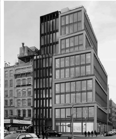
RECENT DEVELOPMENTS IN SOHO (L.) AND NOHO SHOWING THE SCALE ALLOWED UNDER EXISTING RULES. AN UPZONING COULD MORE THAN DOUBLE THE ALLOWABLE SIZE OF NEW DEVELOPMENT