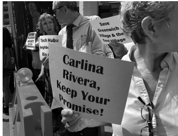
DEMONSTRATING AT THE TECH HUB GROUNDBREAKING