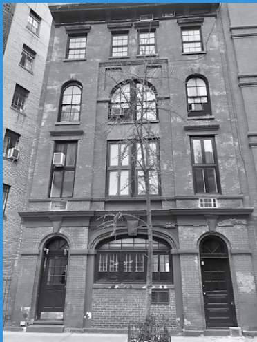
70 BARROW STREET, FROM OUR 'FIREHOUSES' TOUR ON GREENWICH VILLAGE HISTORIC DISTRICT MAP

And we've added dozens of new entries to our Civil Rights and Social Justice Map at gvshp.org/civilrightsmap related to the LGBT, African American, Women's, immigrants, and Asian American civil rights movements. We've also begun a Preservation History Archive at gvshp.org/presarchive , which includes the records of the West Village Committee and its fight against Westway and work with Jane Jacobs to design and build the West Village Houses; letters from preservationist Otis Pratt Pearsall showing the earliest efforts to landmark Greenwich Village in the 1960s; and Village Preservation's own archives going back to our founding in 1980 as the Greenwich Village Trust, and our early work to extend landmark protections to the Greenwich Village waterfront and create the Sheridan Square Viewing Garden and Jefferson Market Garden Fence.