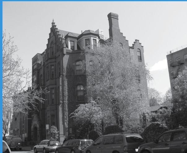
THE FORMER CHILDREN'S AID SOCIETY BUILDING AT 630 EAST 6TH STREET, FROM OUR BUILDING BLOCKS WEBSITE