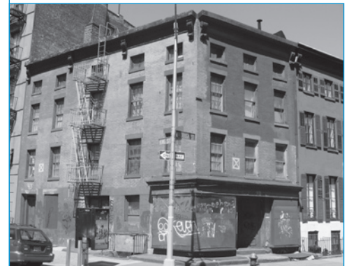
The NoHo Historic District was finally extended (l.); 43 MacDougal Street continues to deteriorate despite its landmark status (r.).

At the City Council, GVSHP successfully fought a hotel developer's efforts to carve the White House Hotel on the Bowery out of the district, and the entire proposed historic district expansion was approved in September. For more info, see gvshp.org/NoHoNews .