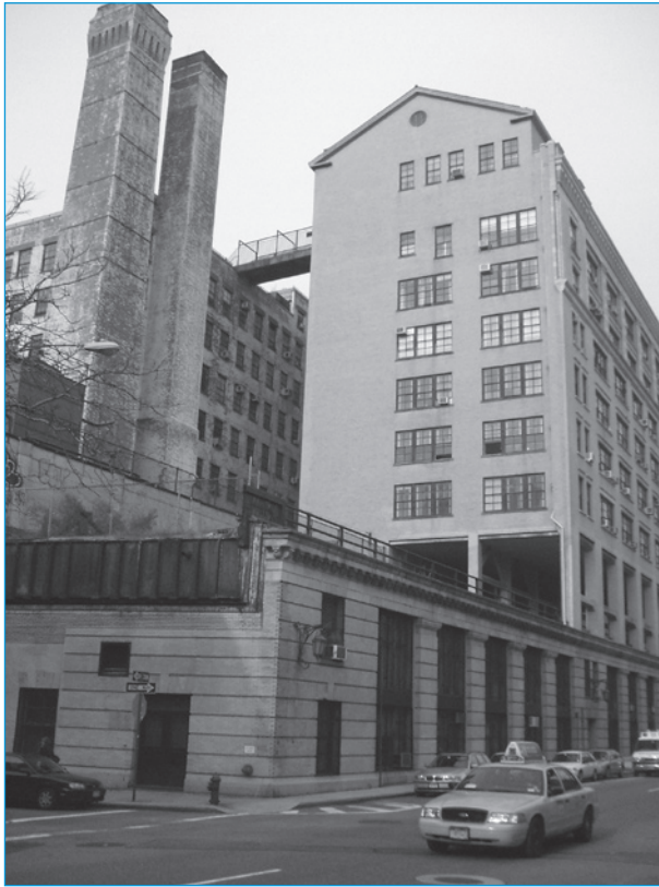
The Westbeth complex; GVSHP is documenting the building's history, while the City is considering possible landmark status.