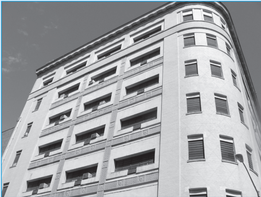
75 Morton Street—neither sold to the highest bidder nor converted into a school.

This summer, GVSHP co-sponsored a forum on the plight of small businesses in our neighborhoods, to call attention to their rapid disappearance and to examine potential solutions. Currently, there is no mechanism like landmark designation to save a valued local small business from extinction the way there is for a beloved historic building. In the coming year, GVSHP will be focusing additional attention on this vexing and growing problem.