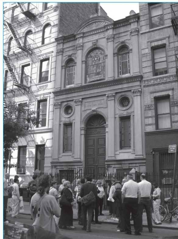
The endangered Congregation Mezritch Synagogue on East 7th Street, the East Village's last operating tenement synagogue.