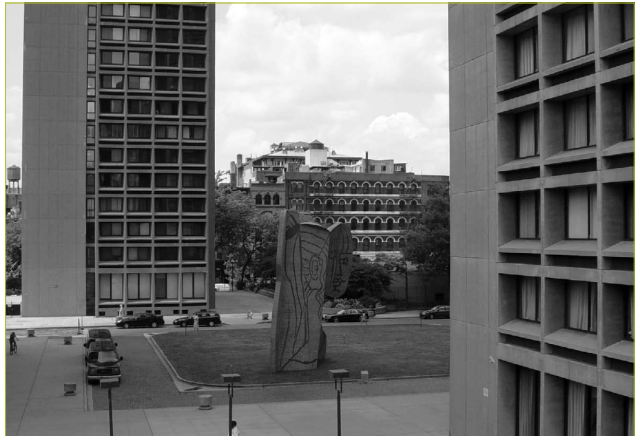
The Silver Towers complex, now being considered for landmark designation.

GVSHP will be working hard to promote our primary principle when it comes to NYU’s development—that the university should stay within its existing footprint and building envelope, and look outside our already-saturated neighborhood if it needs to grow. For more information or to help, see www.gvshp.org/NYUexpansion.htm