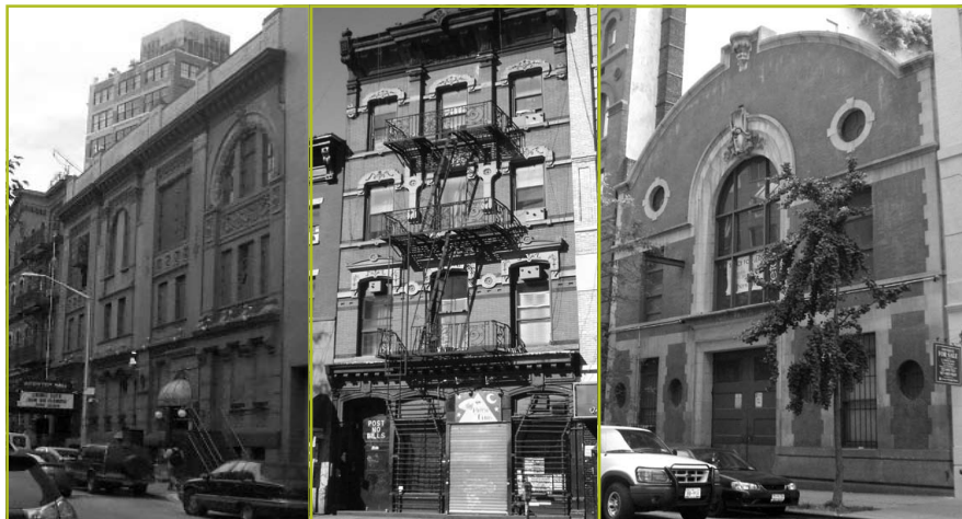
Webster Hall (l.), 101 Avenue A (center), 128 East 13th Street (r.)

As part of our East Village preservation efforts, GVSHP is conducting research on the history of every building in the East Village. This research has shown wonderful patterns exemplified by buildings like Webster Hall, reflecting the East Village's intersection of immigrant history, the labor movement, radical politics, sexual liberation, and artistic innovation.