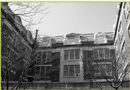
Landmarked former PS 64—saved from a dorm, but not yet from the elements.

in the Far West Village still allow large new development in spite of landmarks regulations, and offers big bonuses for hotel development—a situation GVSHP is working with neighbors to rectify.