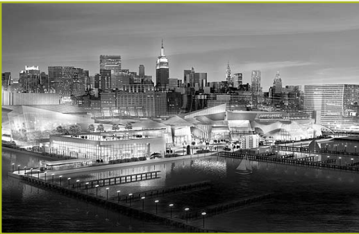
The original "Vegas-on-the-Hudson" plan for Pier 40.