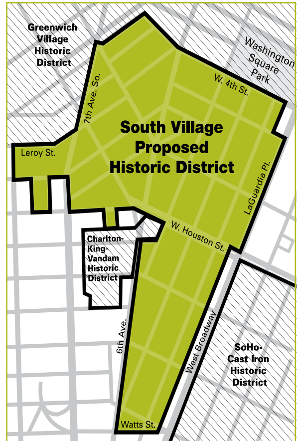
Funding for GVSHP's South Village report was provided by Preserve New York, a grant program of the Preservation League of NY State and the NY State Council on the Arts.

GVSHP also continues to battle against the development at 159 Bleecker Street, the site of the former Circle in the Square Theatre in the South Village. This outsized and inappropriate building was given a zoning bonus to build larger than normally allowed by the City because the developer claimed it would contain a "community facility"—in this case, a dorm. But GVSHP exposed the