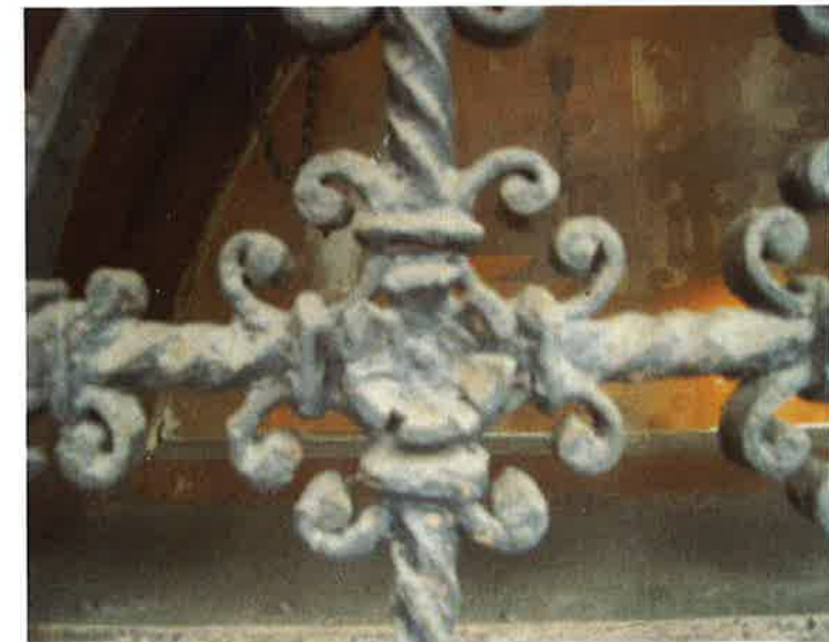
2 PHOTO - EXISTING MEDALLION TO BE MATCHED A-801 N.T.S.