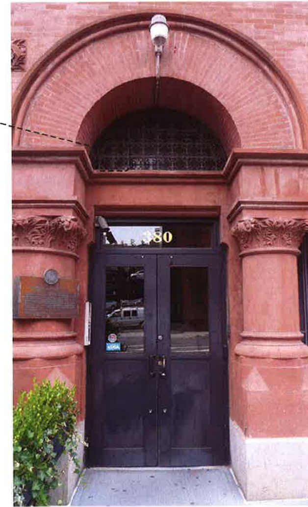
1 PHOTO - EXISTING ENTRY DOOR AT 380 LAFAYETTE STREET A-801 N.T.S.

ARCHITECT: ERNST ARCHITECT, PLLC 177 WEST BROADWAY, THIRD FLOOR NEW YORK, NY 10013 ©2014 TODD A. ERNST P.A. TEL (212) 343-3102 FAX (212) 343-3109 ernst_arch@earthlink.net