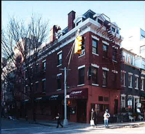
Landmarks designation photo (2013)