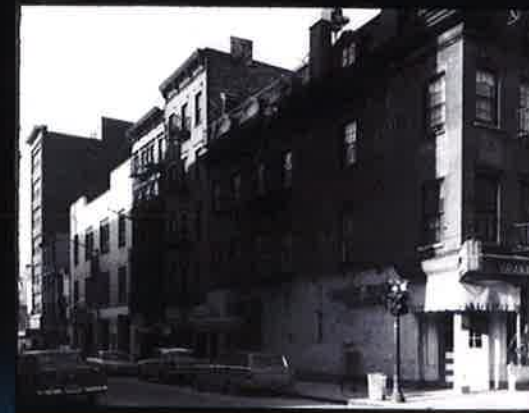
New York Tax Records, 1960