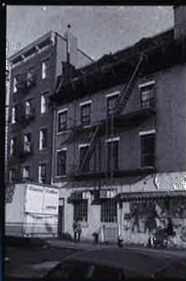
New York Tax Records, 1980