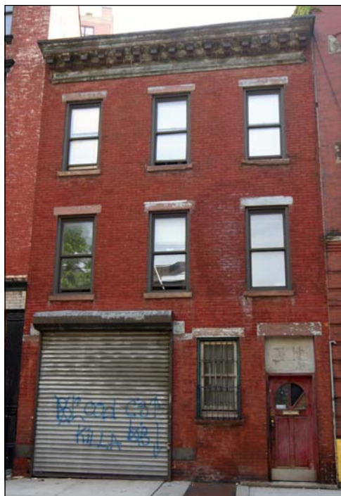
7 Weehawken Street