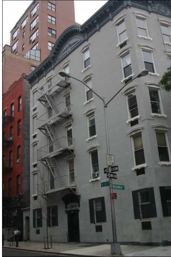
304 West 10th Street

305 WEST 10TH STREET, NORTH SIDE, BETWEEN WASHINGTON STREET AND WEST STREET