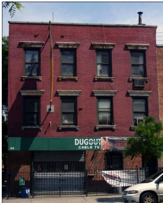
185 Christopher Street