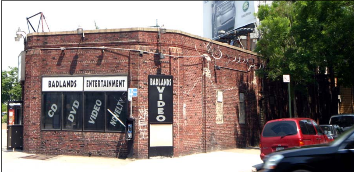
388-390 West Street