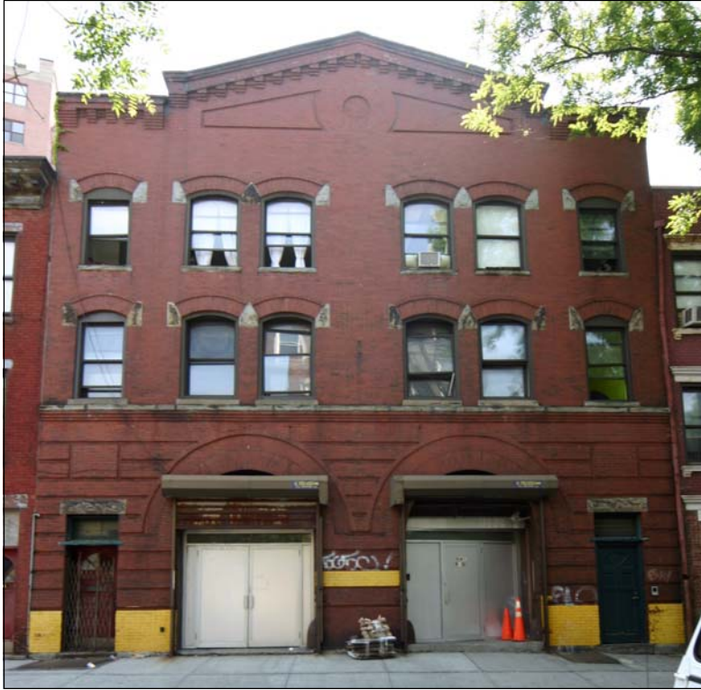
9-11 Weehawken Street