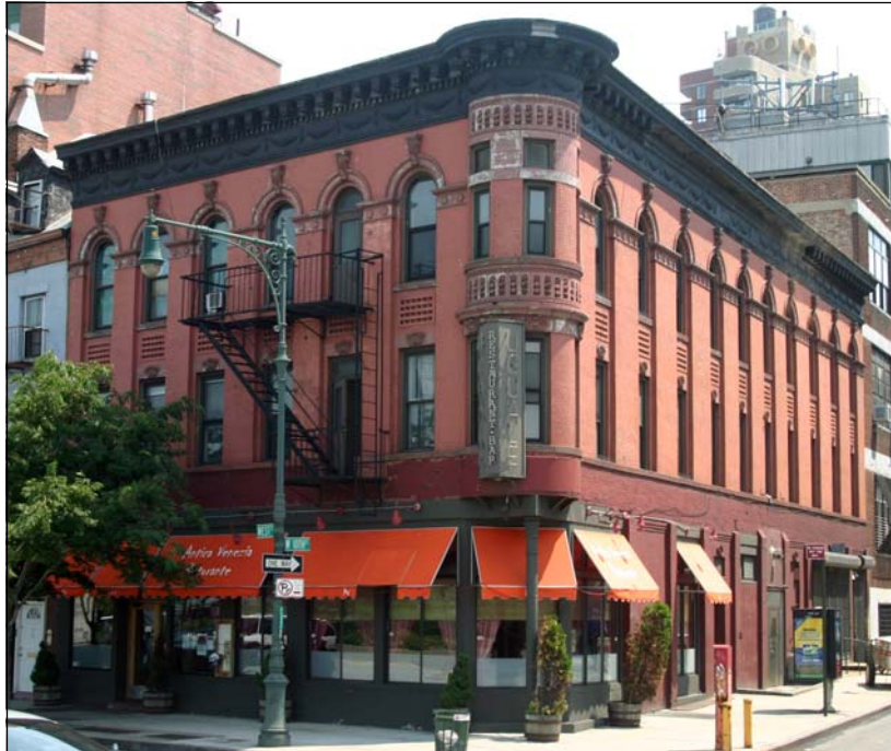
396-397 West Street