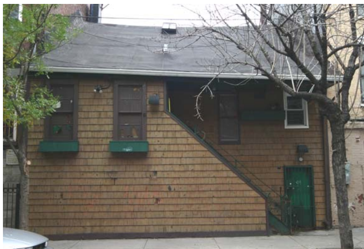
392-393 West Street, Weehawken Street Facade