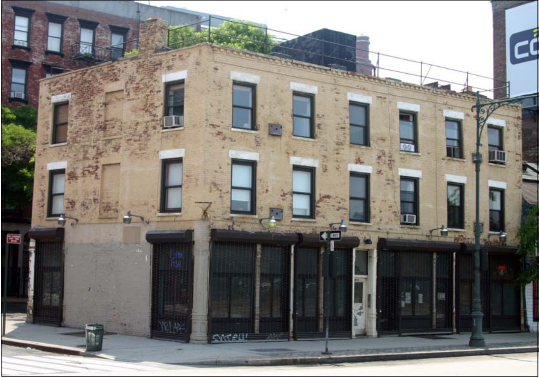
394-395 West Street