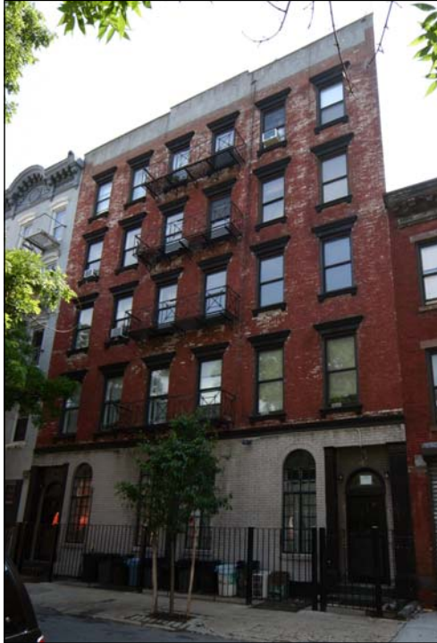
3-5 Weehawken Street