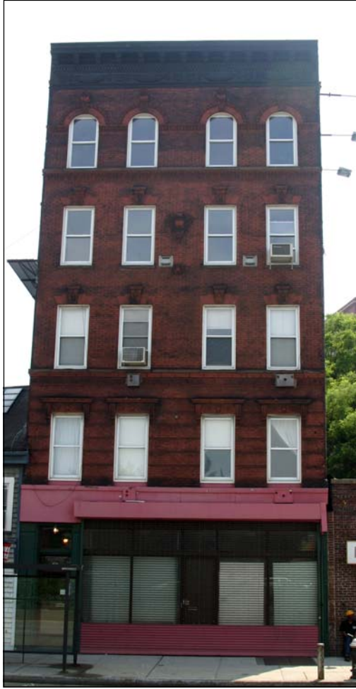
391 West Street