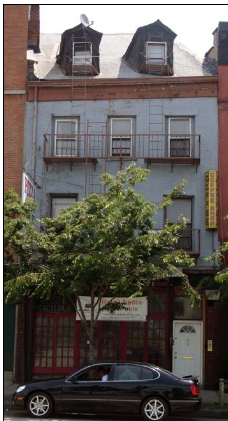
398 West Street