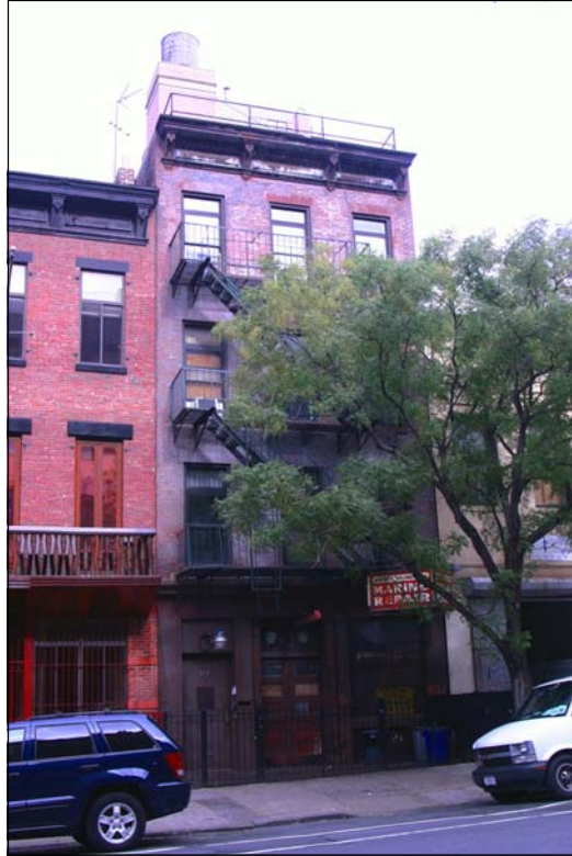
177 Christopher Street

Photographs: NYC, Dept. of Taxes (c.1939); LPC, John Barrington Bayley (1964); LPC (c. 1983, 2005); Greenwich Village Society for Historic Preservation (1988, 2004).