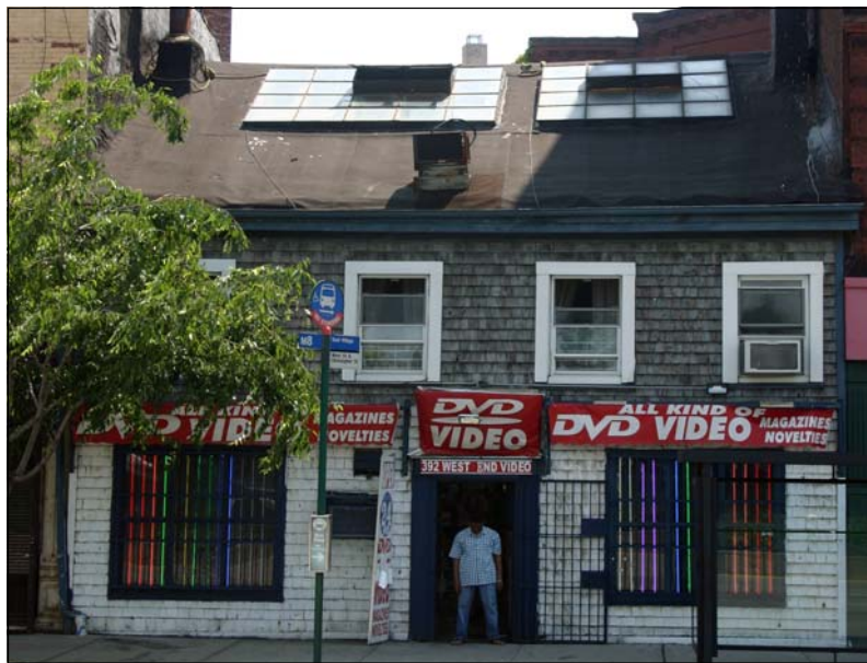
392-393 West Street