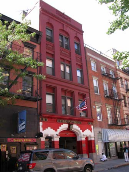
Fire Patrol Building #2 84 West 3 rd Street