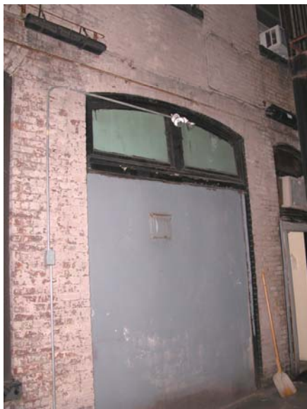
Below left: rear façade Below right: stable