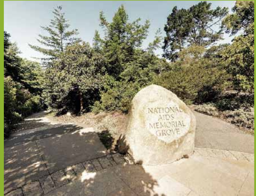
National AIDS Memorial Grove, Golden Gate Park, San Francisco