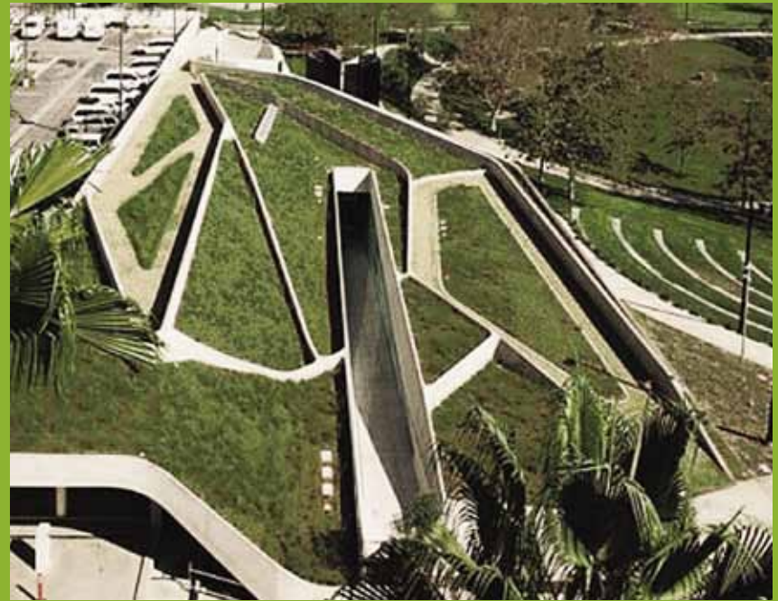
Los Angeles Holocaust Museum, Pan Pacific Park, Los Angeles