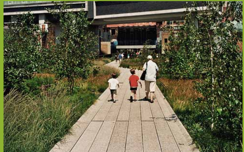
The High Line came out of a thoughtful design process