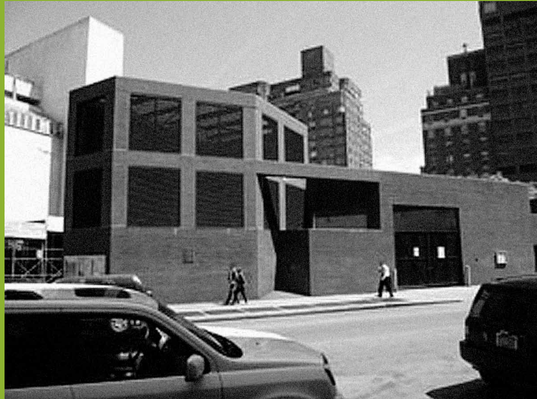
Gas tanks will obstruct views of the new park