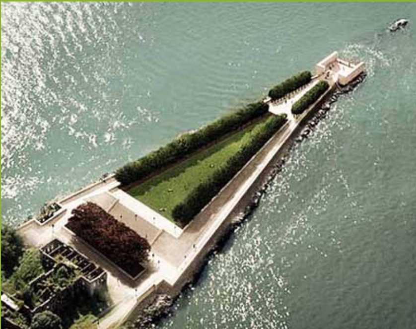
Four Freedoms Park , Roosevelt Island, New York City