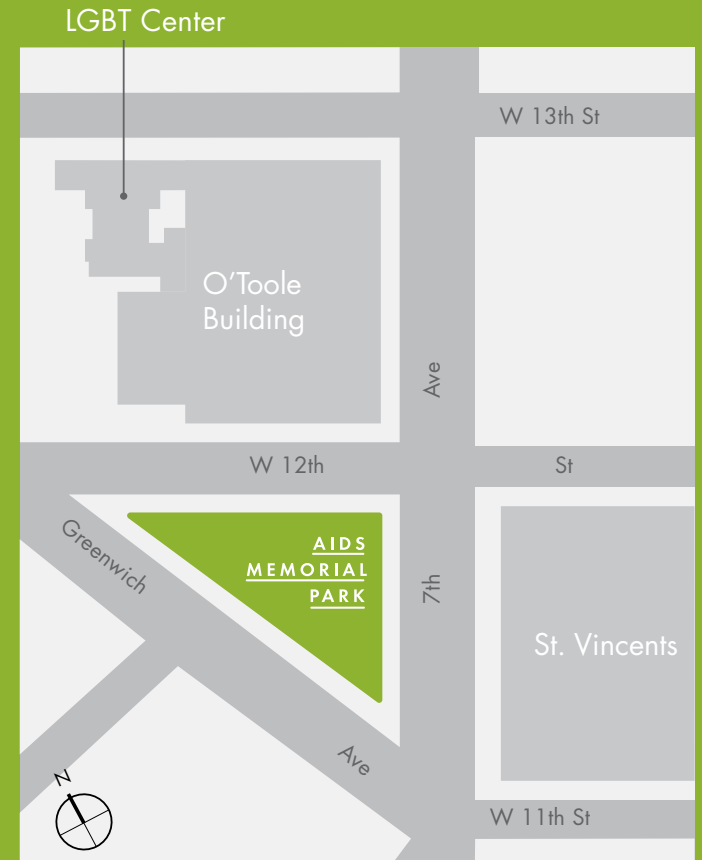
Gateway to the Village