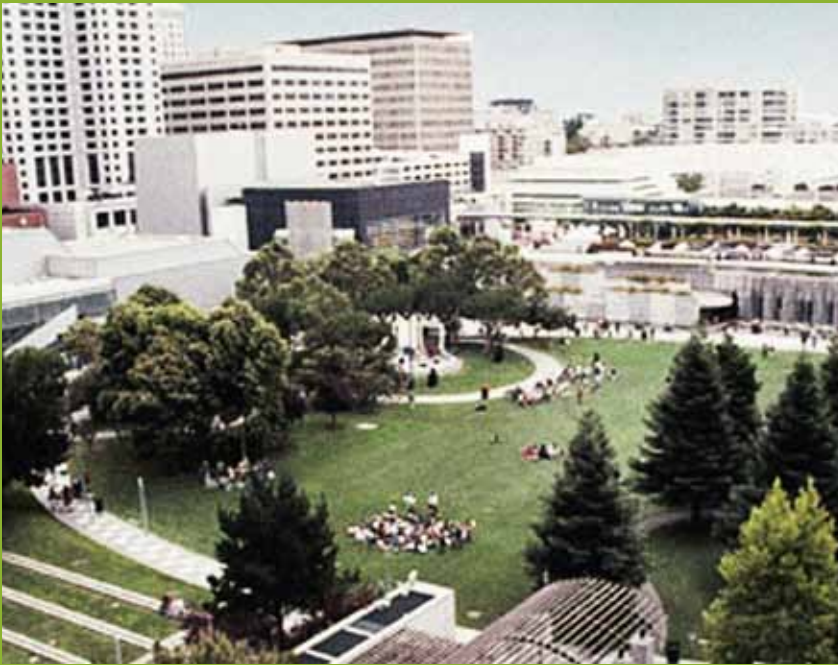
Martin Luther King Memorial, Yerba Buena, San Francisco