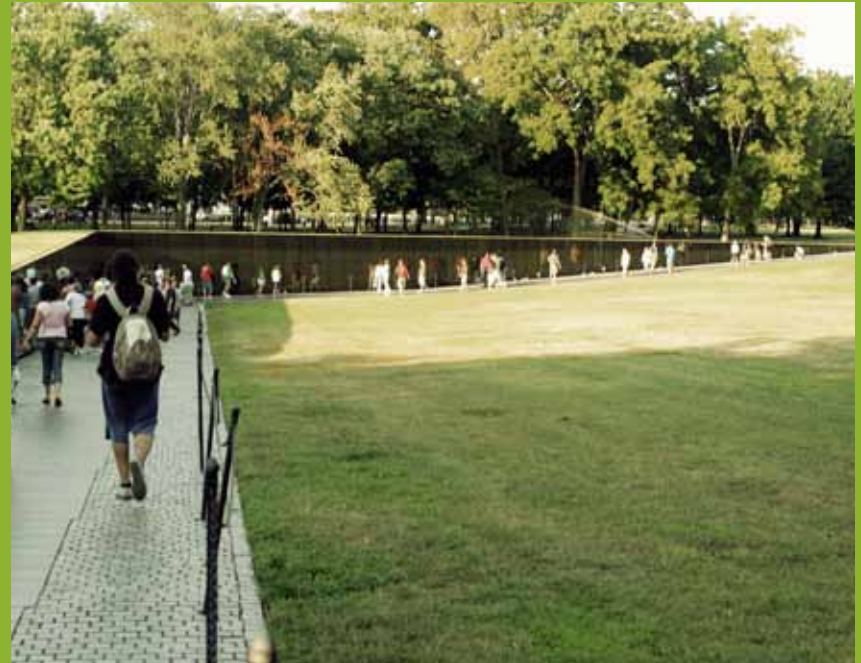
Vietnam Veterans Memorial , Washington D.C.