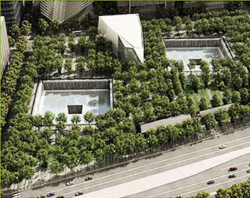
September 11 Memorial , New York City