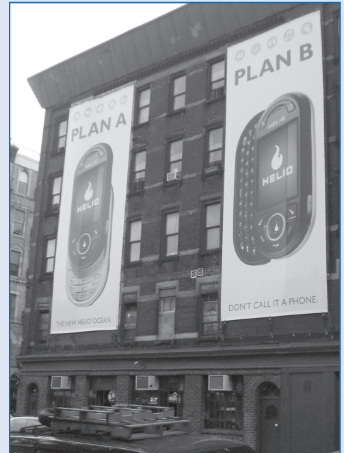
108 Avenue B, one of several locations from which GVSHP was able to get illegal billboards removed; many more remain, however.

GVSHP has established an illegal billboard tracking and monitoring system to report and seek the removal of these signs throughout our neighborhood. Though we face an enforcement and adjudication system that is extremely lax in its response to illegal billboards, we have succeeded in getting billboards removed in the Meatpacking District, the East Village, and Noho, and in getting violations issued against dozens more throughout the Village. But many, many more remain. Call or e-mail us to report an illegal billboard; see www.gvshp.org/GansvBlbd.htm