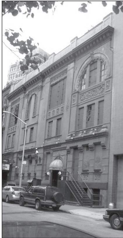
Webster Hall in the East Village, which GVSHP researched and proposed for landmark designation.