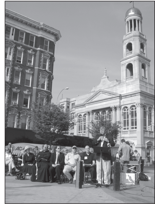
Columbus Day event celebrating the release of GVSHP's "Italians of the South Village" report; State Senator Tom Duane is speaking.

The South Village remains an incredible collection of 19 th and early 20 th century architecture, with cultural, social, and ecclesiastical institutions connected to the neighborhood's proud history of immigrant struggle, cultural innovation, and political ferment. But that history is increasingly threatened by demolitions and inappropriate