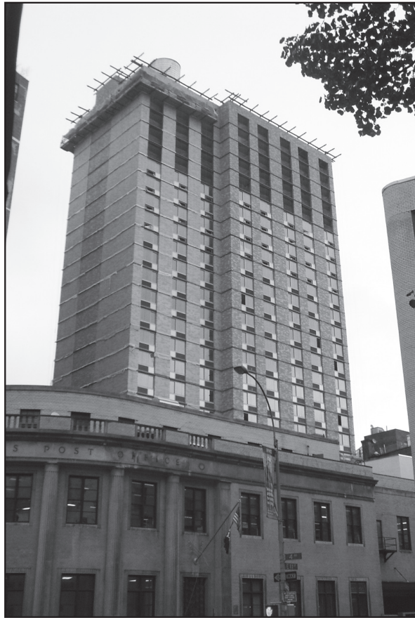
NYU's 26-story mega-dorm under construction on East 12th Street. The university's projected growth over the next 25 years is the equivalent of thirty-four more of these.

year planning process, and began participation in a "Community Working Group" convened by Borough President Stringer, through which they have begun to share information with the public about their long-term growth needs. Perhaps more importantly, NYU has begun working with the City to examine locations for possible satellite campuses and other farther afield locations for their facilities, which has already resulted in the university locating a graduate student dorm in Downtown Brooklyn. Much as we had long urged, NYU is