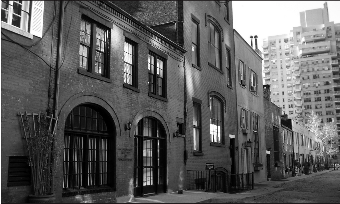
Eighteen of twenty-six landmarked buildings on Washington Mews were not marked as landmarks in Buildings Department records.

mission to evaluate and hold hearings on any such major request (requests to knock down landmarked buildings are of course virtually never granted).