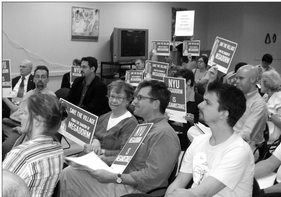
GVSHP members and neighbors protesting NYU’s mega-dorm plans.