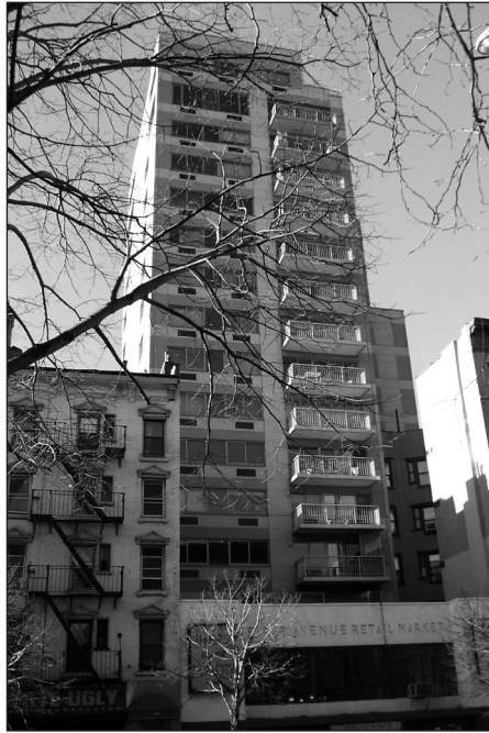
Out-of-context tower which would be prohibited under new zoning for East Village.

In July, 2006, the City came out with a plan in response to many of these recommendations, which is now being presented to the public for comment before any formal review process begins and the series of votes it must undergo are taken. The plan can be viewed on our website at www.gvshp.org/preserve/pdf/EVRezoning.pdf . GVSHP pointed to some strong positives and negatives in the plan.