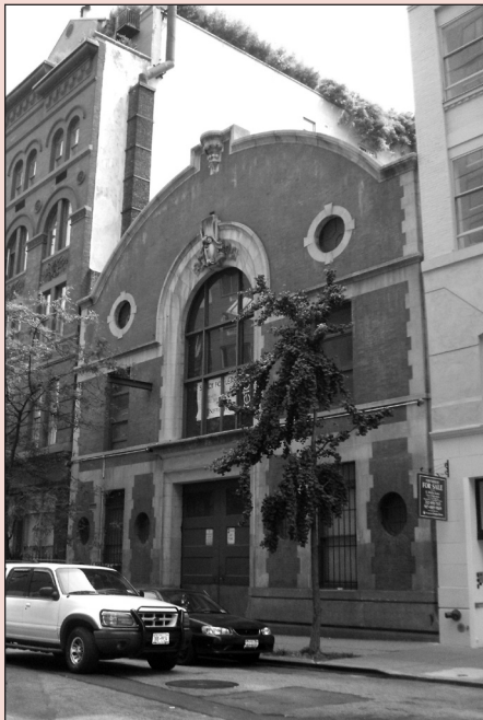
128 East 13th Street faces demolition if not landmarked.

In response to a broad campaign led by GVSHP to save the Far West Village from overdevelopment, in 2005 the City promised to extend the Greenwich Village Historic District three blocks west, create a new Weehawken Street Historic District, and designate eight individual landmarks in the Far West Village. These were promised to be done by Spring 2006. The historic district designations took place in May of this year, but the individual designations have taken longer. In October, the City held hearings on the first of three of these eight promised landmarks, and we are pushing for a vote to designate soon. We also continue to push for the five remaining promised designations to move ahead as quickly as possible. For more information or to help, go to www.gvshp.org/preserve/fwindividuals.htm .